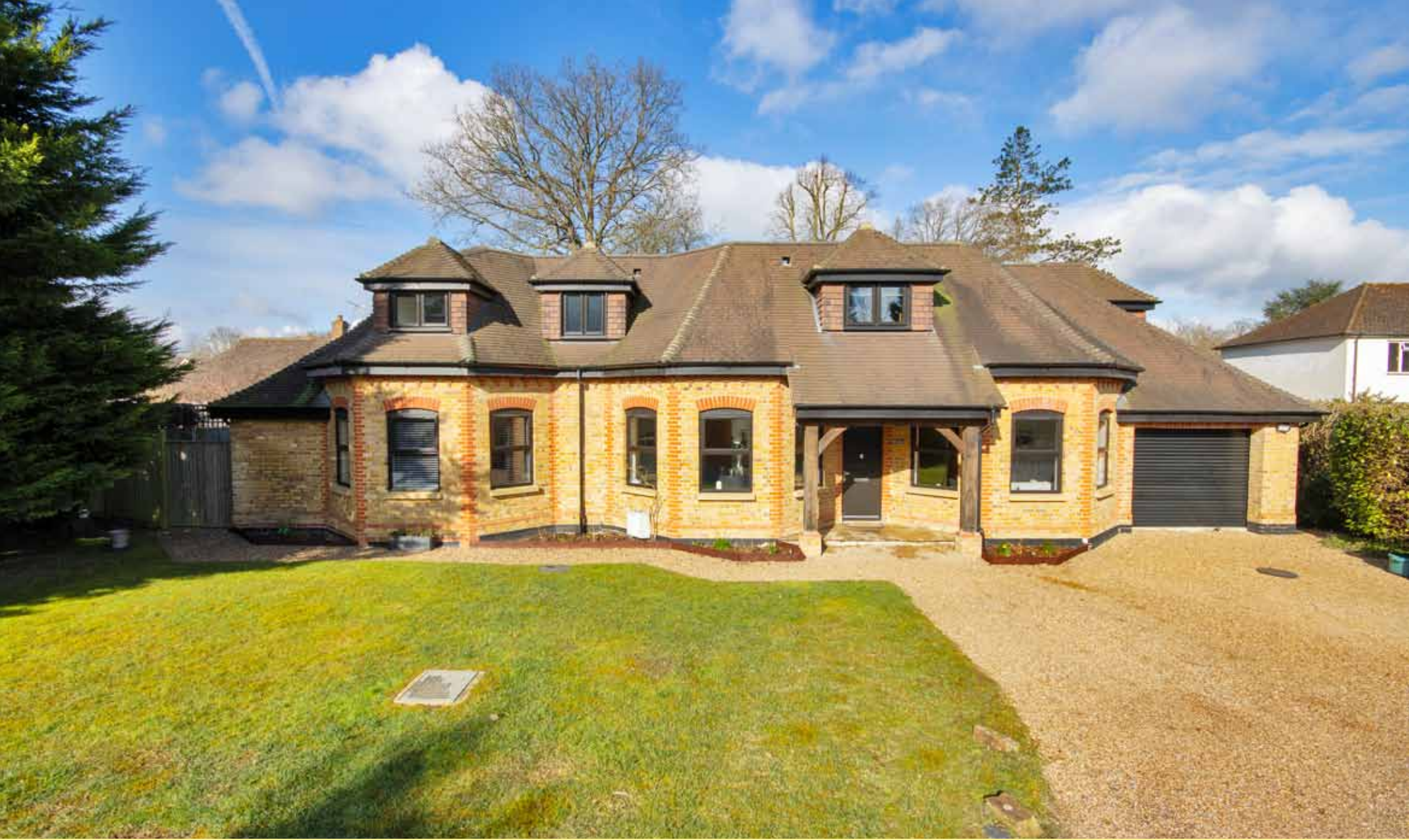
April Lodge, Coldharbour Lane, Hildenborough Kent TN11 9JT Guide: £2,200,000 Freehold