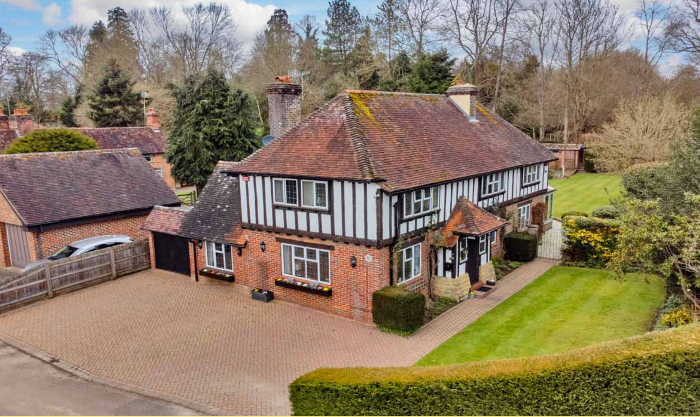
Moat Cottage, Doubleton Lane, Penshurst, Kent TN11 8JA Guide: £1,300,000 Freehold