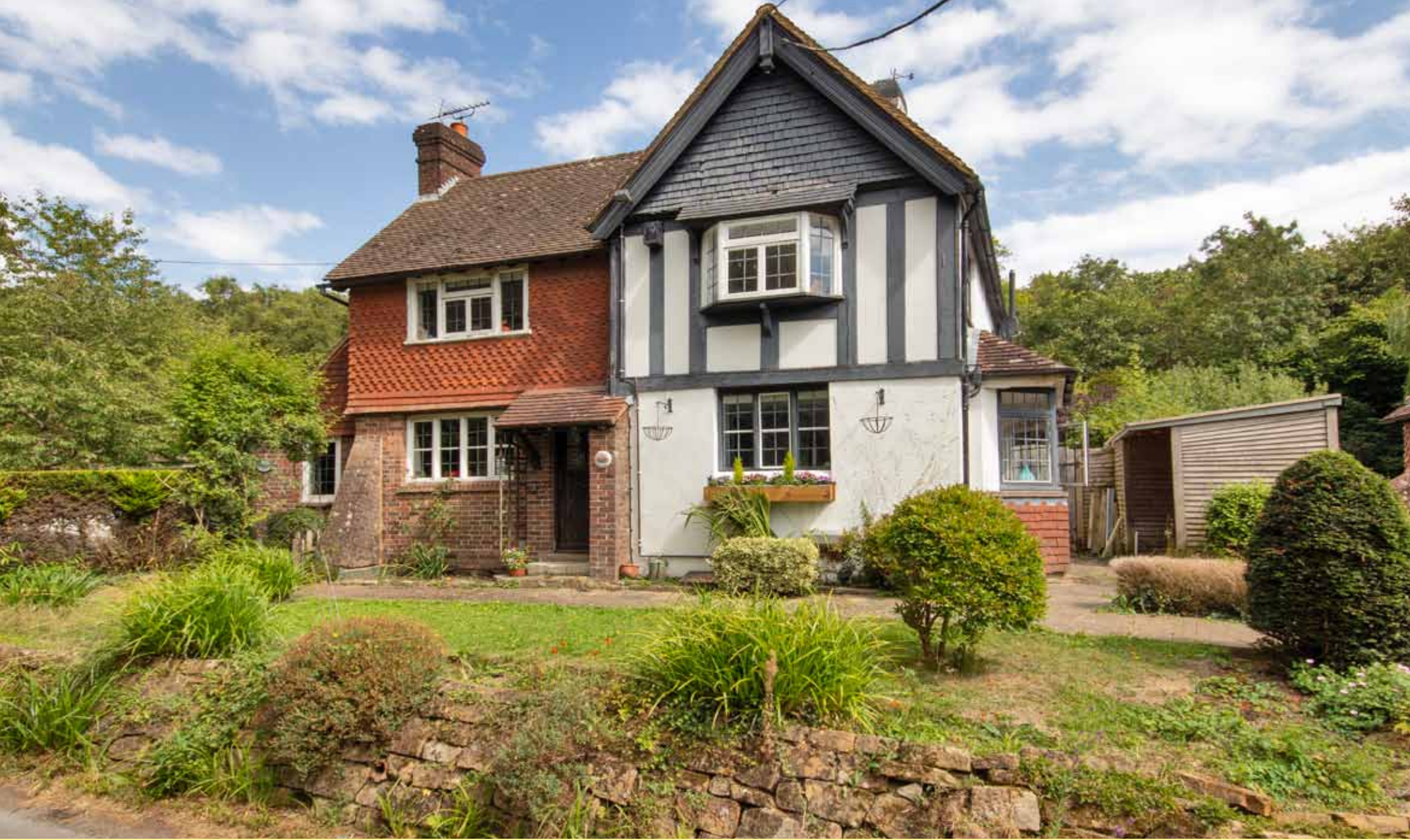
Orchard Cottage, Poundsbridge Lane, Penshurst. TN11 8AE Guide Price: £1,170,000 Freehold