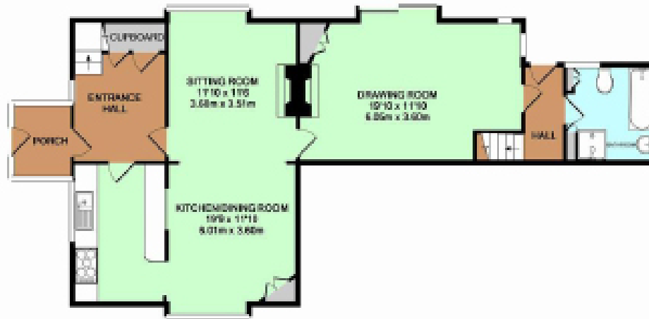
GROUND FLOOR APPROX. FLOOR AREA 890 SQ.FT. (82.050 M 2 )