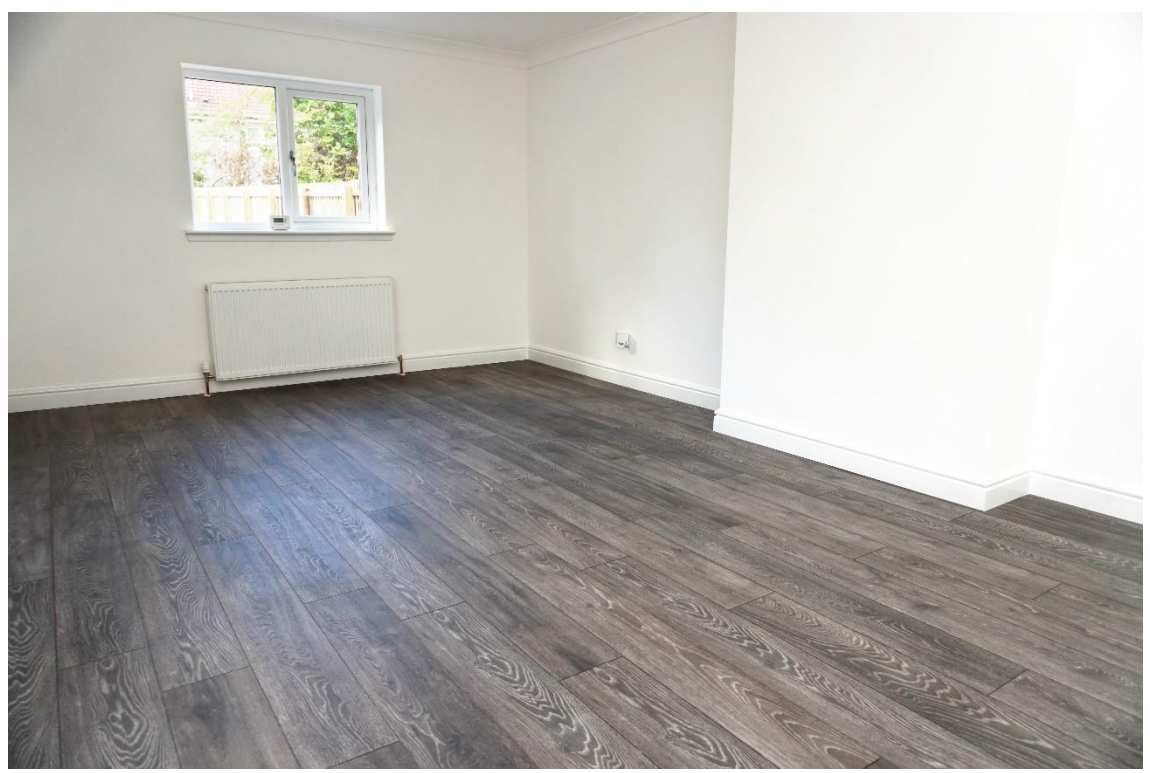
It comprises on the ground level of the welcoming hallway, spacious lounge/dining room overlooking the front and rear garden, and new and very well-equipped kitchen.