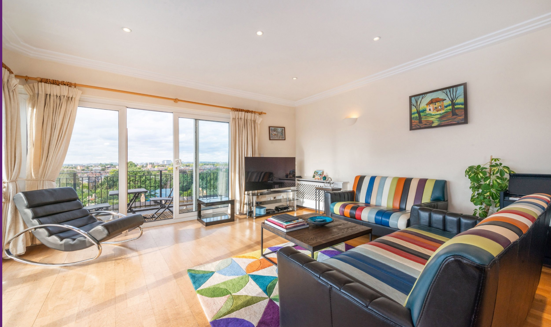
Brittany House 261 Upper Richmond Road, SW15