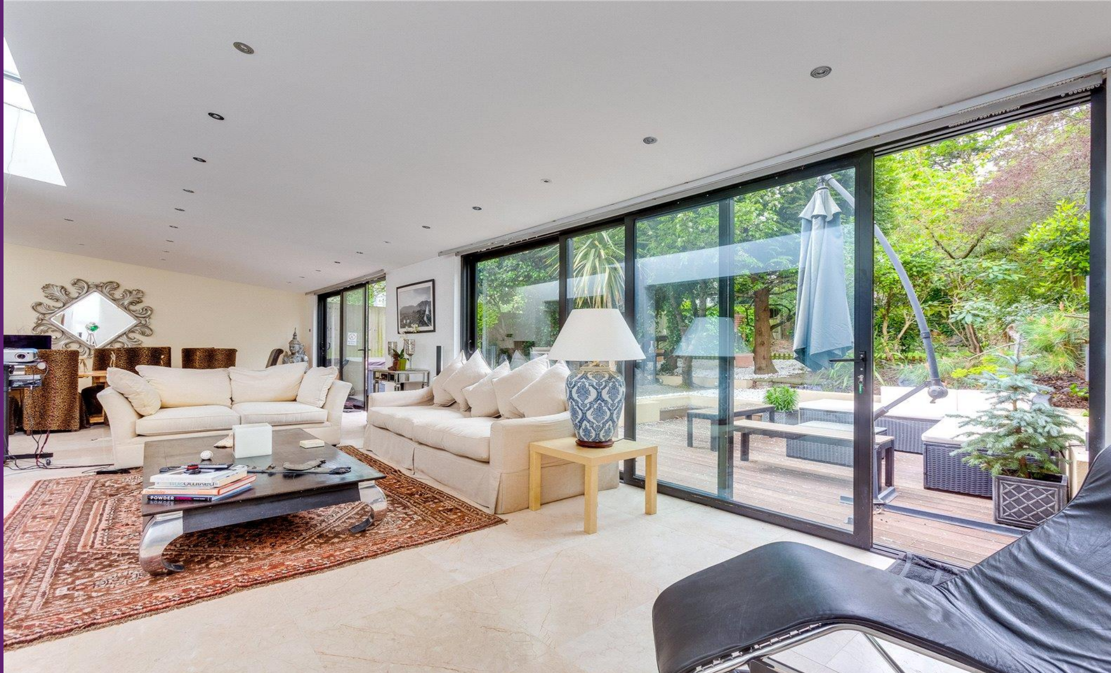
Sutherland Grove London, SW18