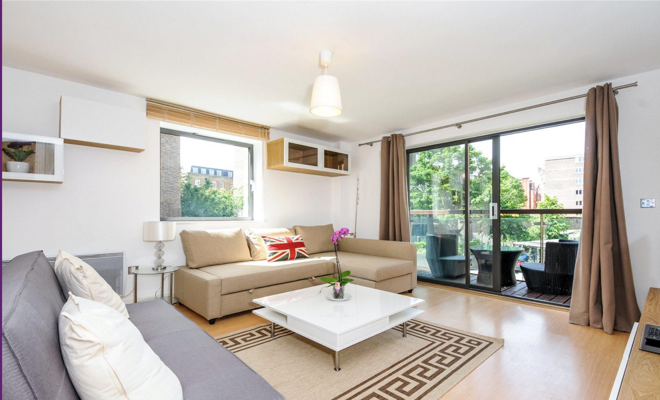
Tounson Court Montaigne Close, SW1P