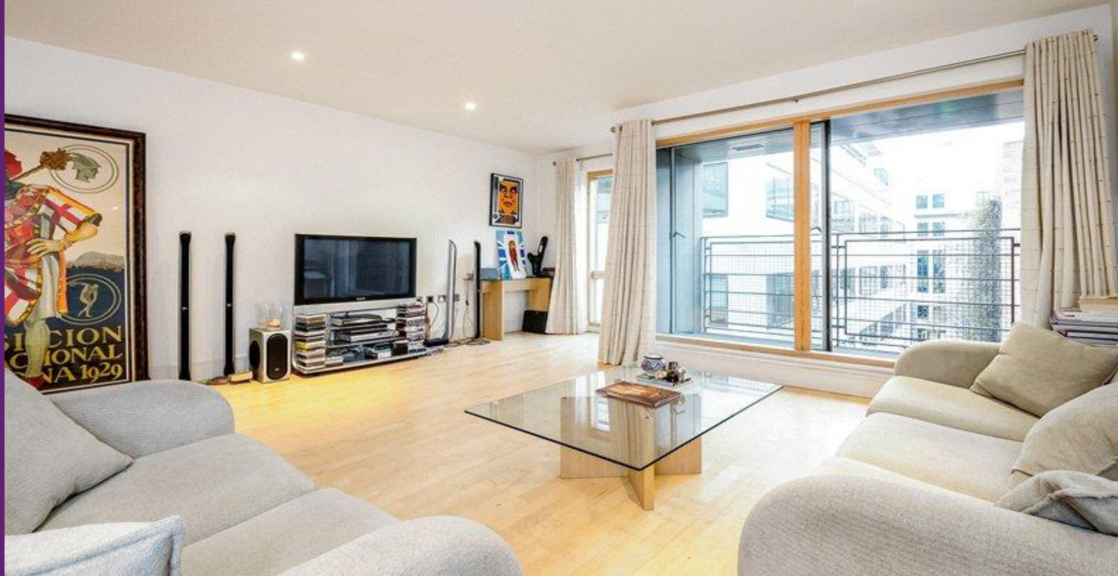
Asquith House 27 Monck Street, SW1P