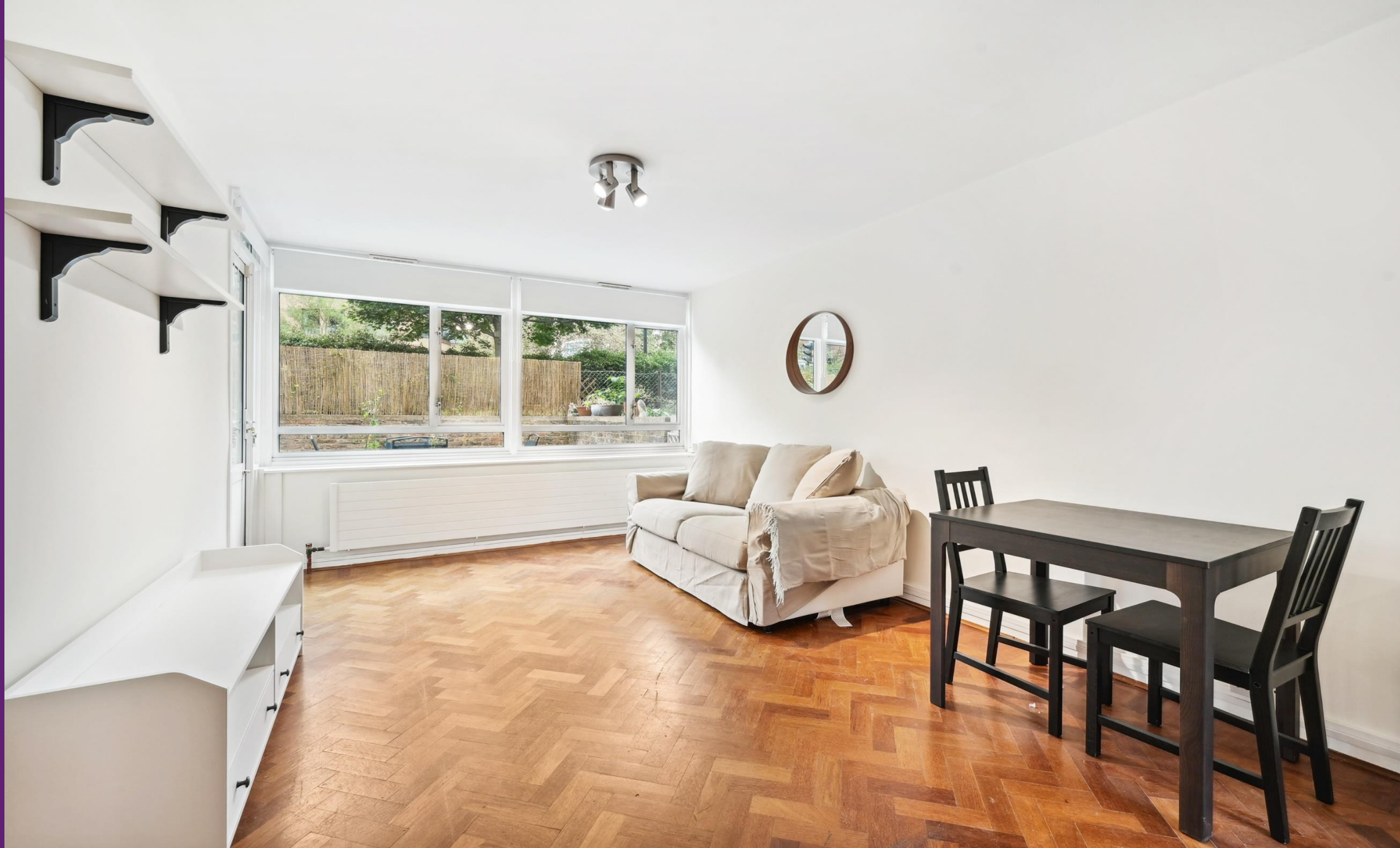
Hungerford House Churchill Gardens, SW1V