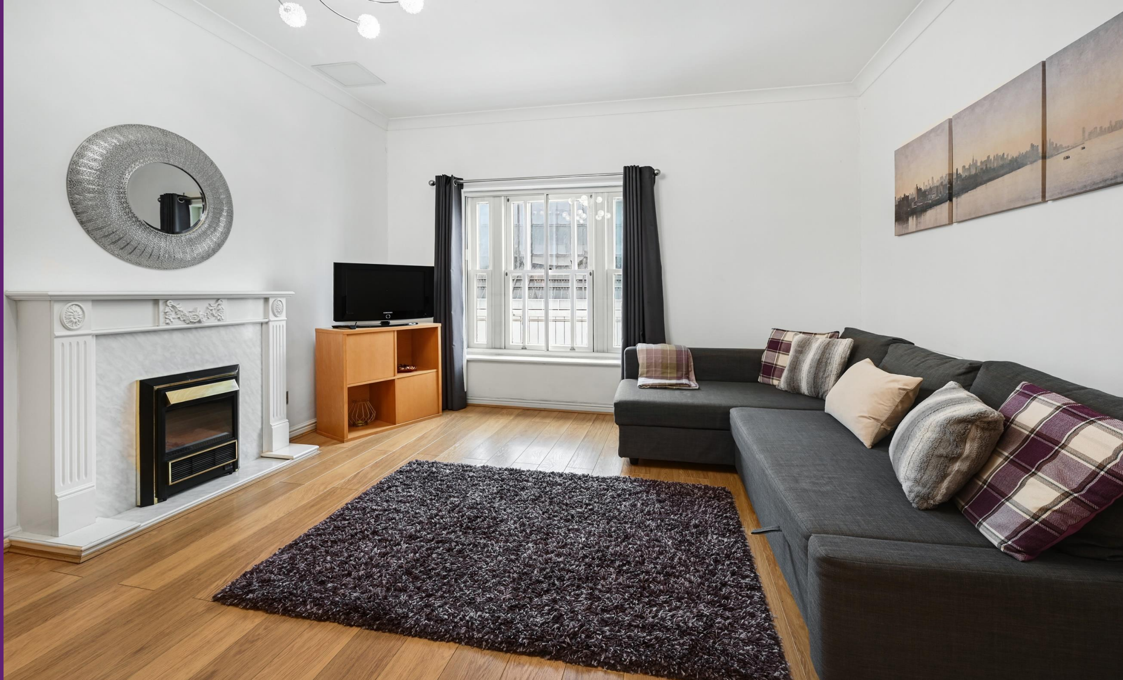
Royal Belgrave House Hugh Street, SW1V