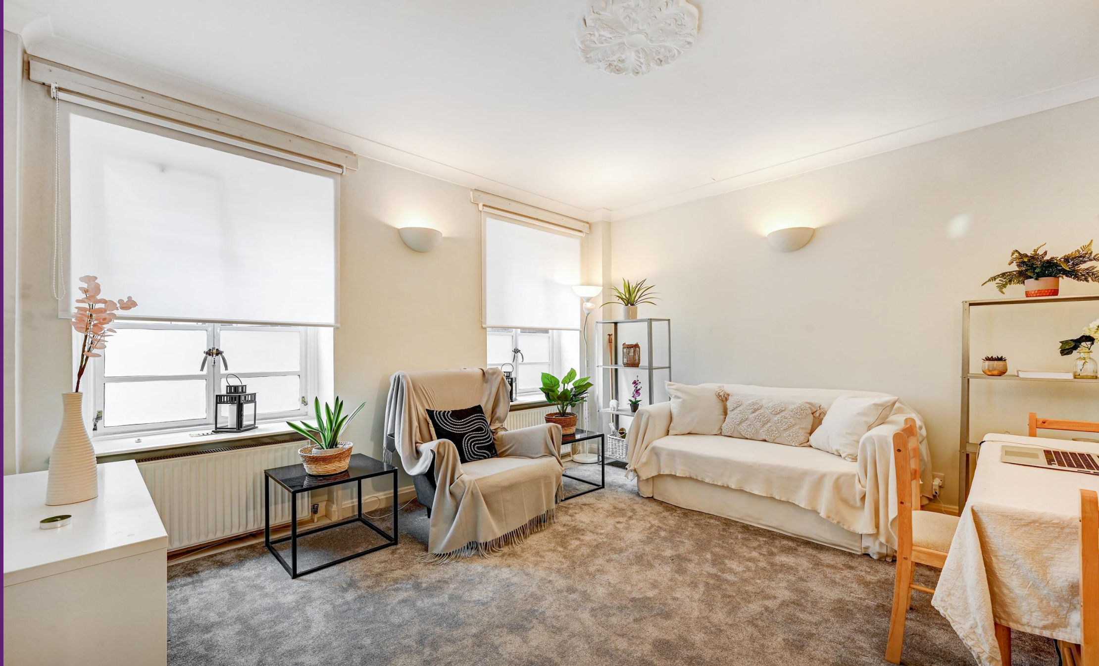
Vandon Court Petty France, SW1H