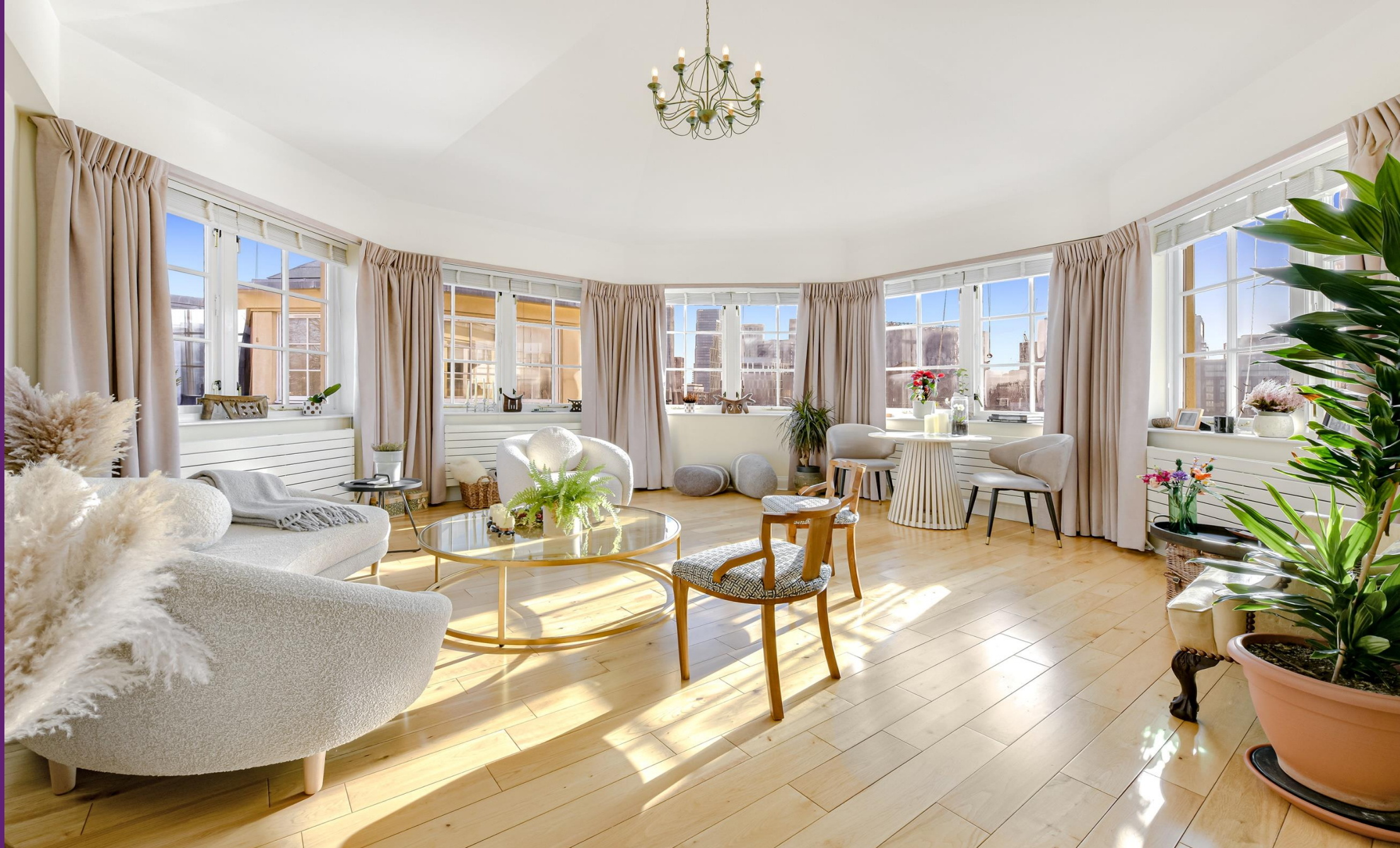
Belvedere House 130 Grosvenor Road, SW1V