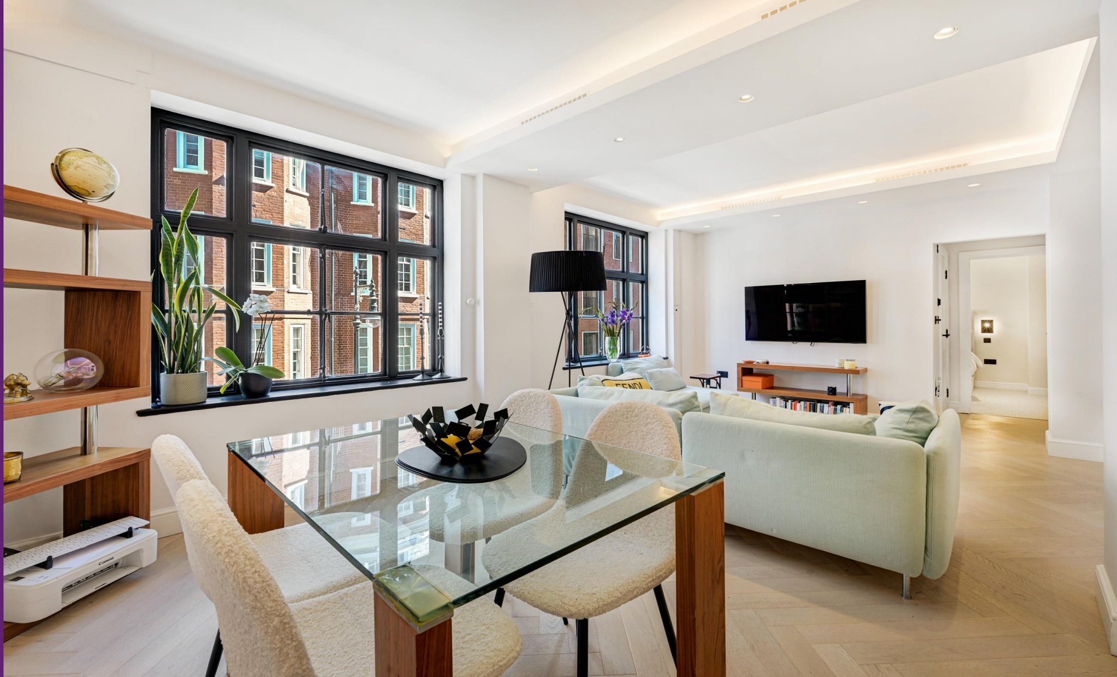
Carrington House Hertford Street, W1J