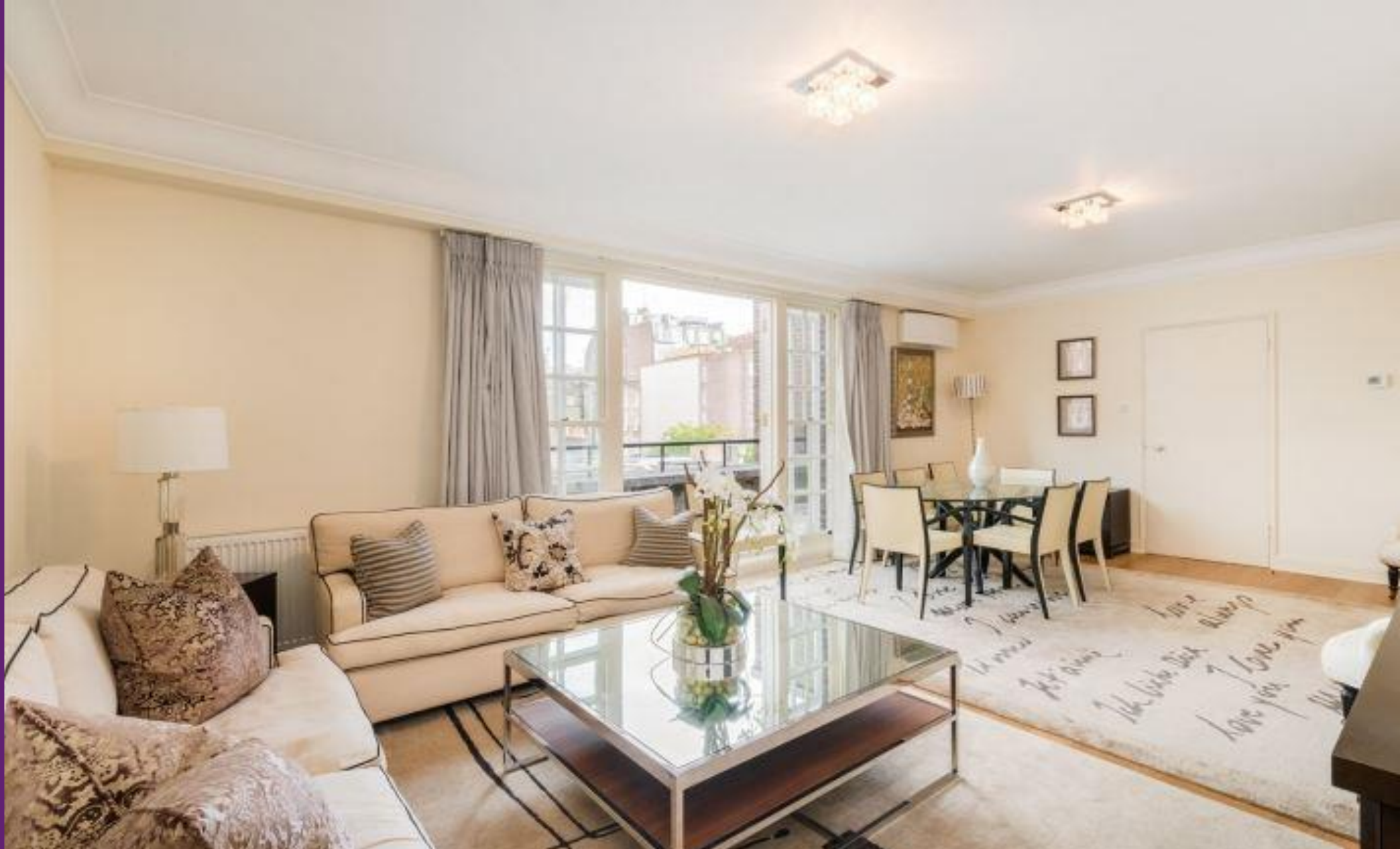
Park Mount Lodge 12-14 Reeves Mews, W1K