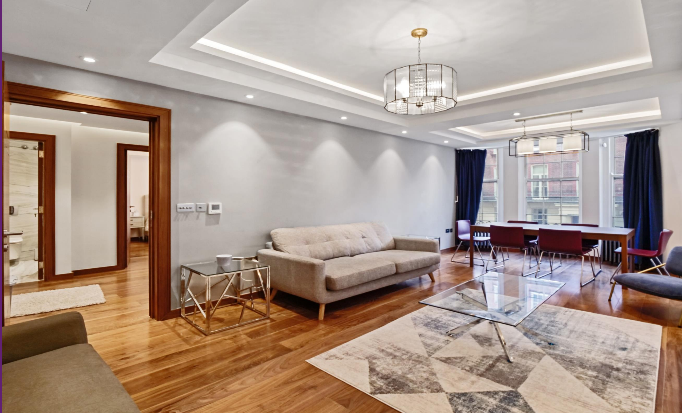
Eaton House 39-40 Upper Grosvenor Street, W1K