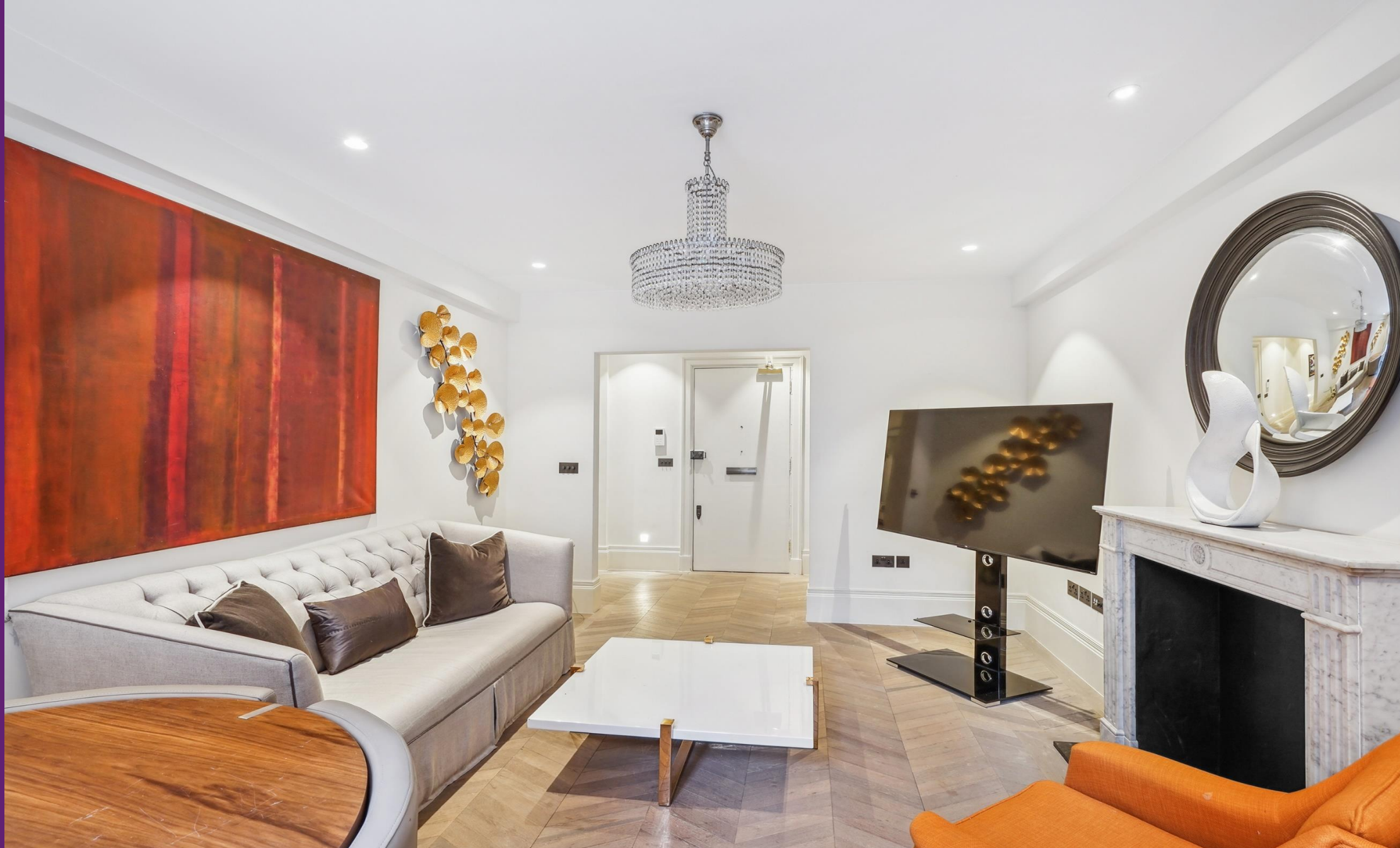
Chesterfield House South Audley Street, W1K