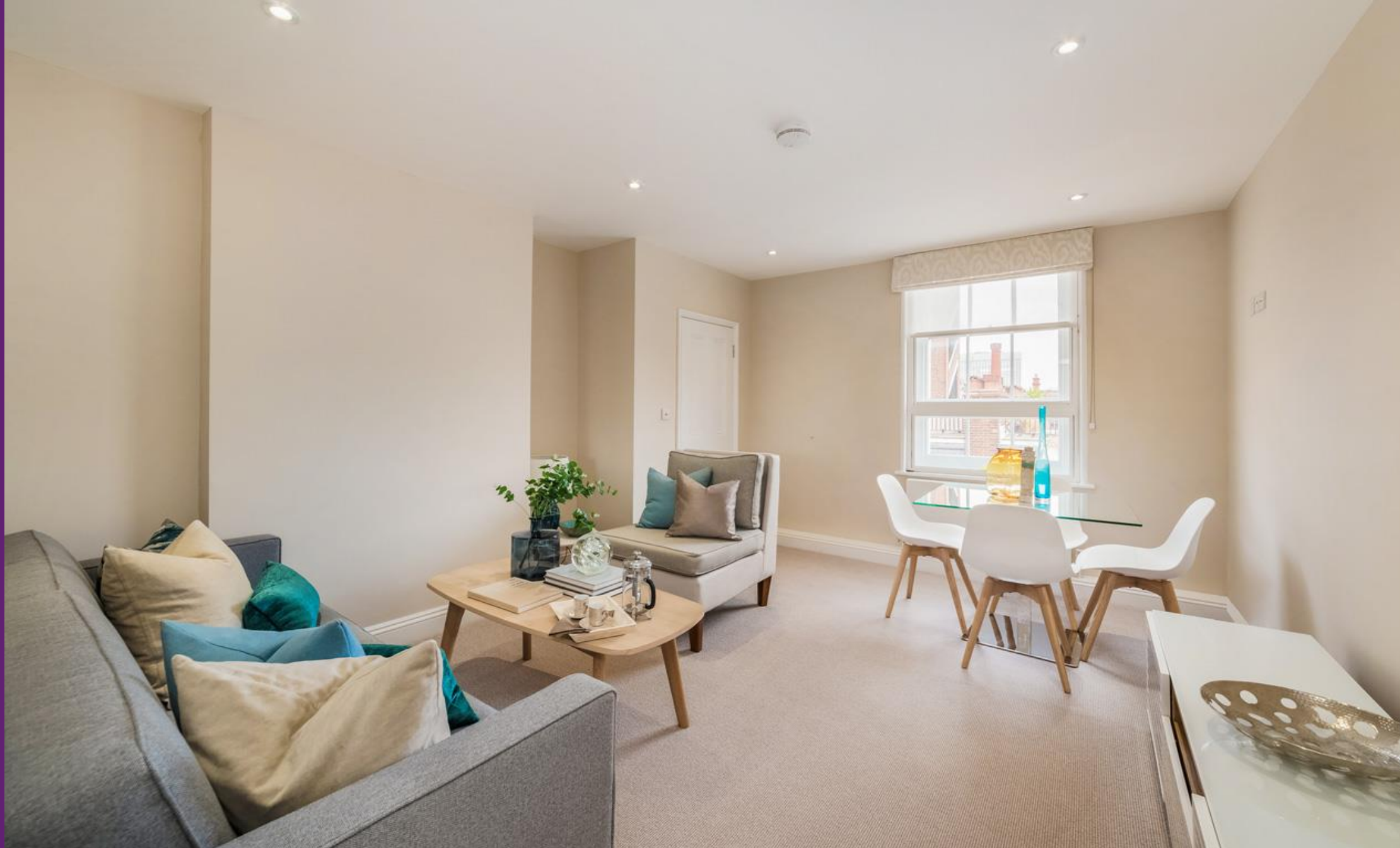
Clarendon Flats Balderton Street, W1K