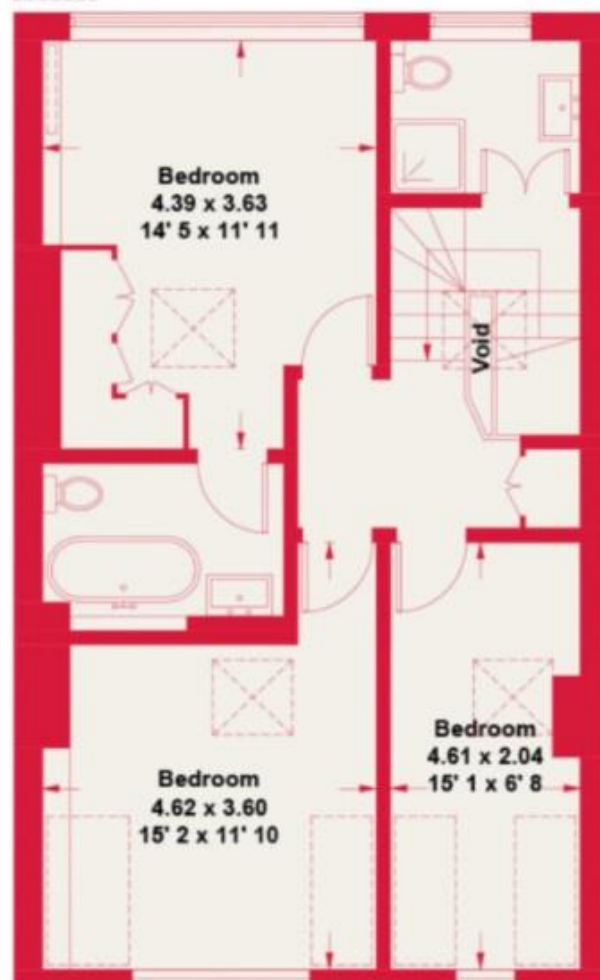
Second Floor 640 sq ft / 59.5 sq m (Including Reduced Headroom / Excluding Void)