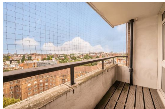
Stuart Tower 105 Maida Vale, W9