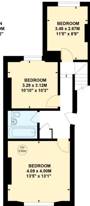
Raised Ground Floor

This plan is not to scale and must be used as layout guidance only. All measurements and areas are approximate and should not be relied upon to provide accurate information. This plan must not be relied upon when making property valuations, design considerations or any other such relevant decisions. We accept no responsibility or liability (whether in contract, tort or otherwise) in relation to any loss whatsoever arising from or in connection with any use of this plan or the adequacy, accuracy or completeness of it or any information within it.