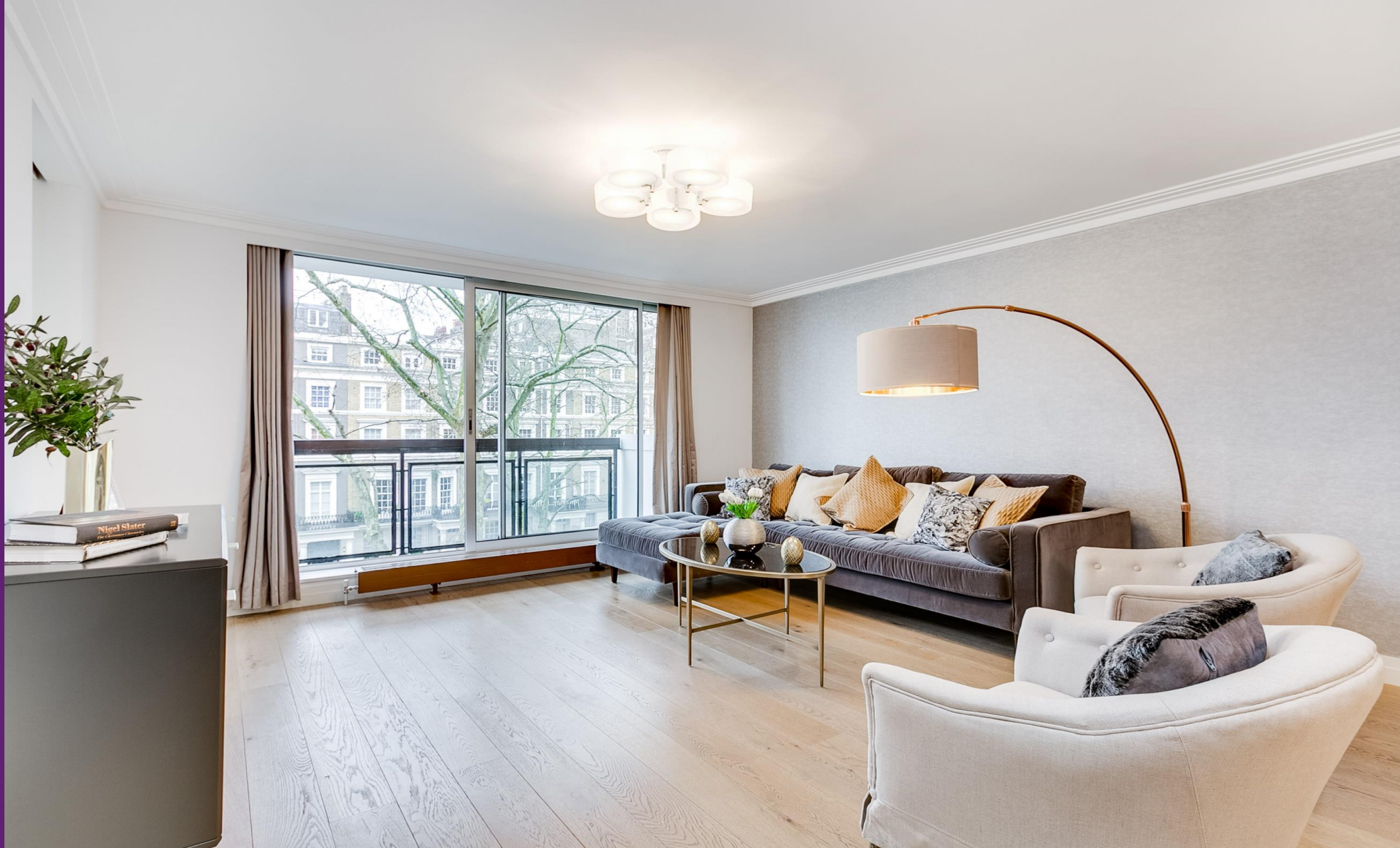
Rutland Gate Knightsbridge, SW7