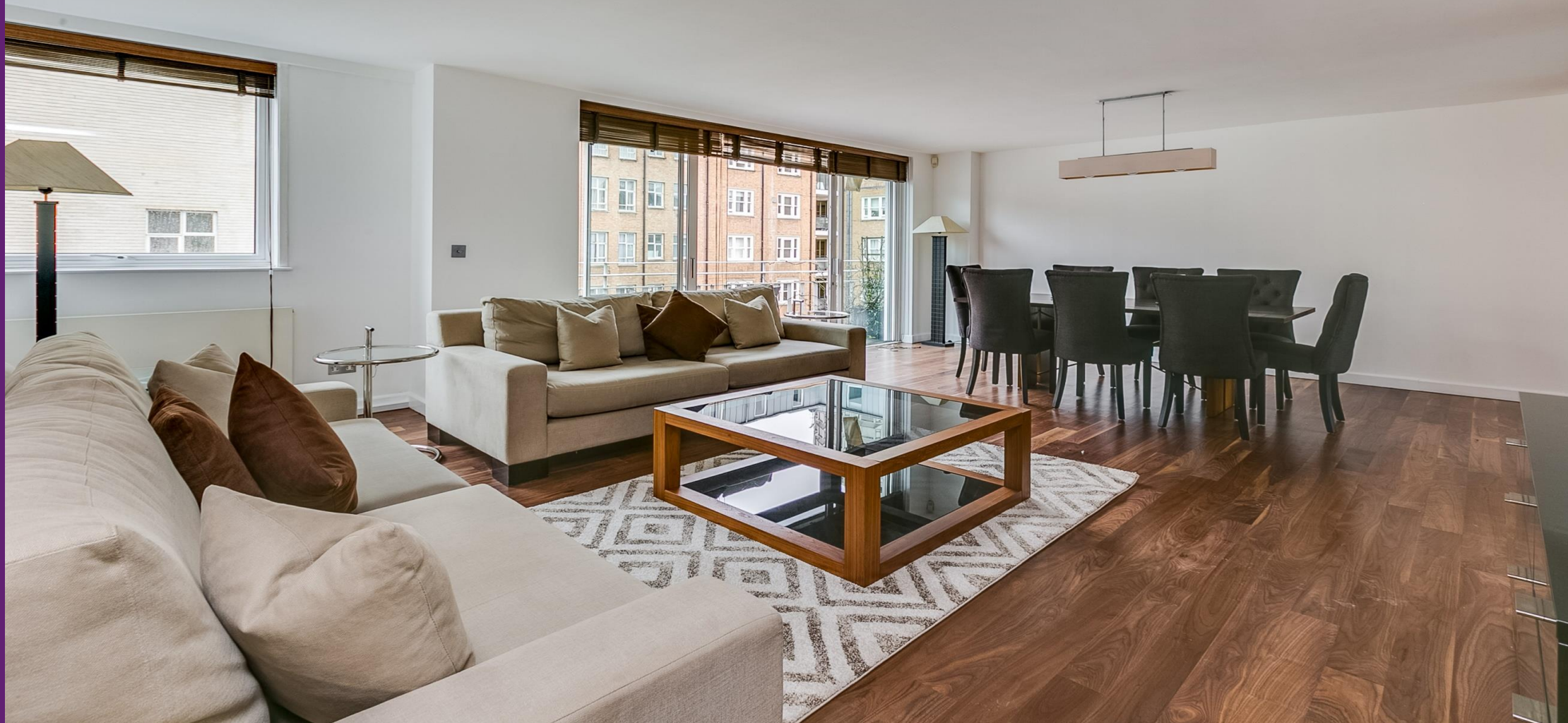
Whaddon House William Mews, SW1X