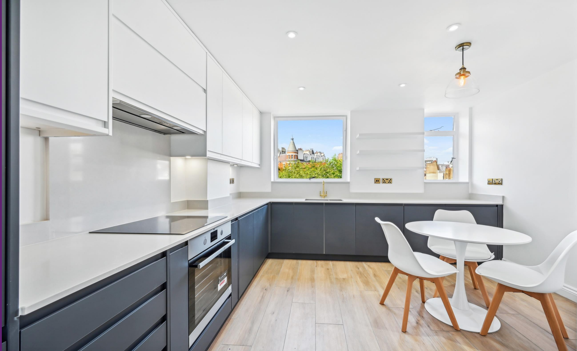
Cliveden House 26-29 Cliveden Place, SW1W