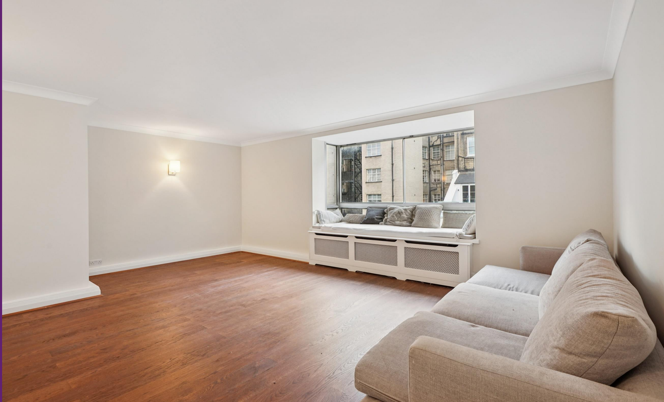
Thorburn House Kinnerton Street, SW1X