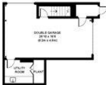
LOWER GROUND FLOOR GROSS INTERNAL FLOOR AREA 348 SQ FT

Although every attempt has been made to ensure accuracy, all measurements are approximate. The floor plan's for illustrative purposes only and not to scale. Measured in accordance to RICS standards. DE-PHOTOGRAPHY.NET