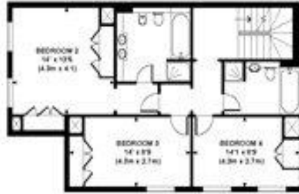
FIRST FLOOR GROSS INTERNAL FLOOR AREA 317 SQ FT