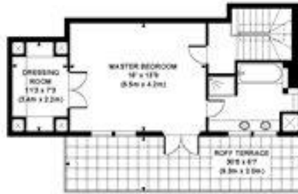
SECOND FLOOR GROSS INTERNAL FLOOR AREA 126 SQ FT