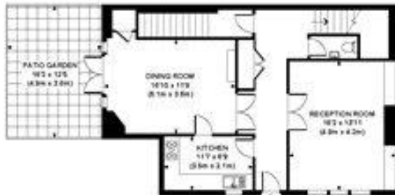
GROUND FLOOR GROSS INTERNAL FLOOR AREA 317 SQ FT