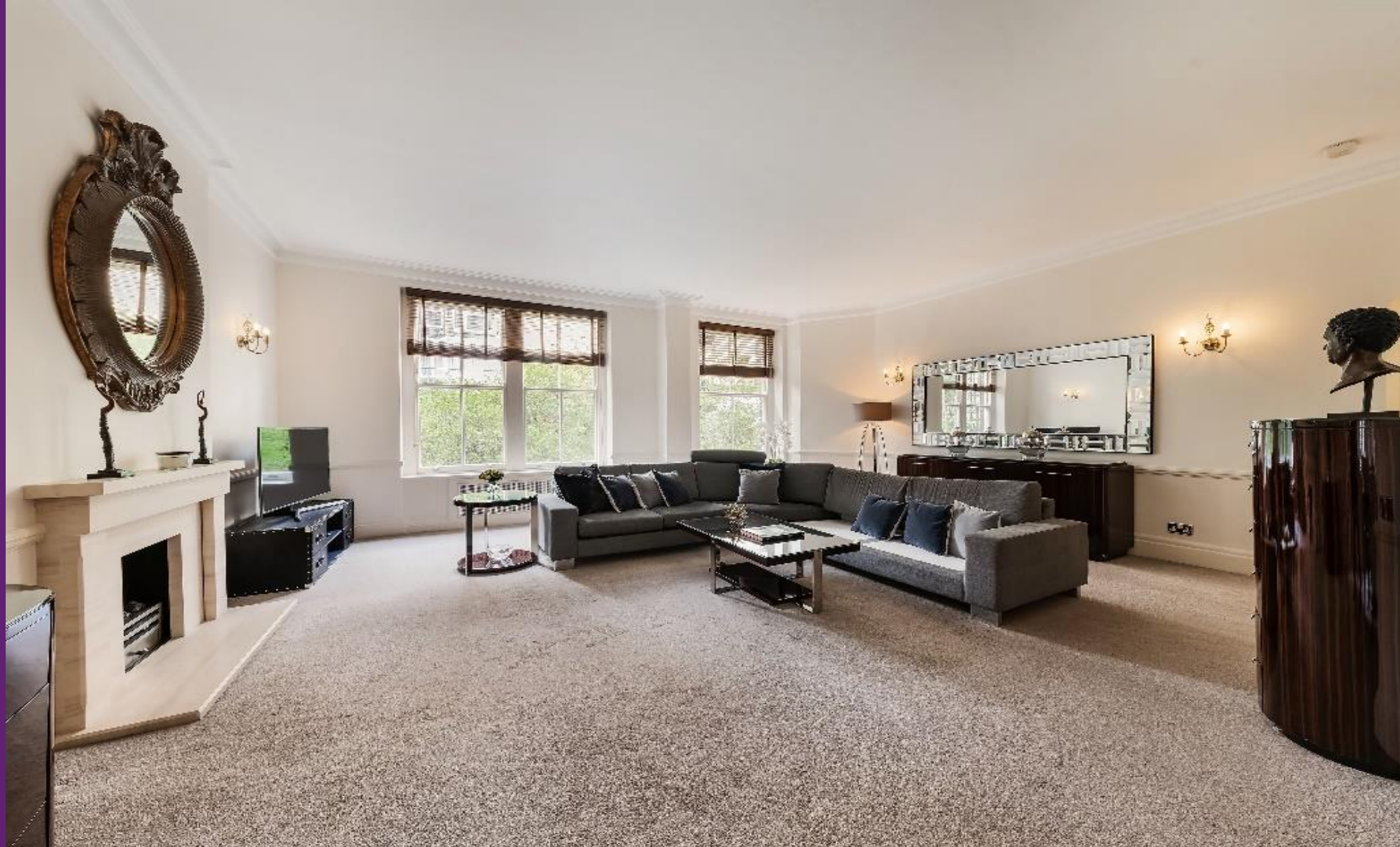
Lincoln House Basil Street, SW3