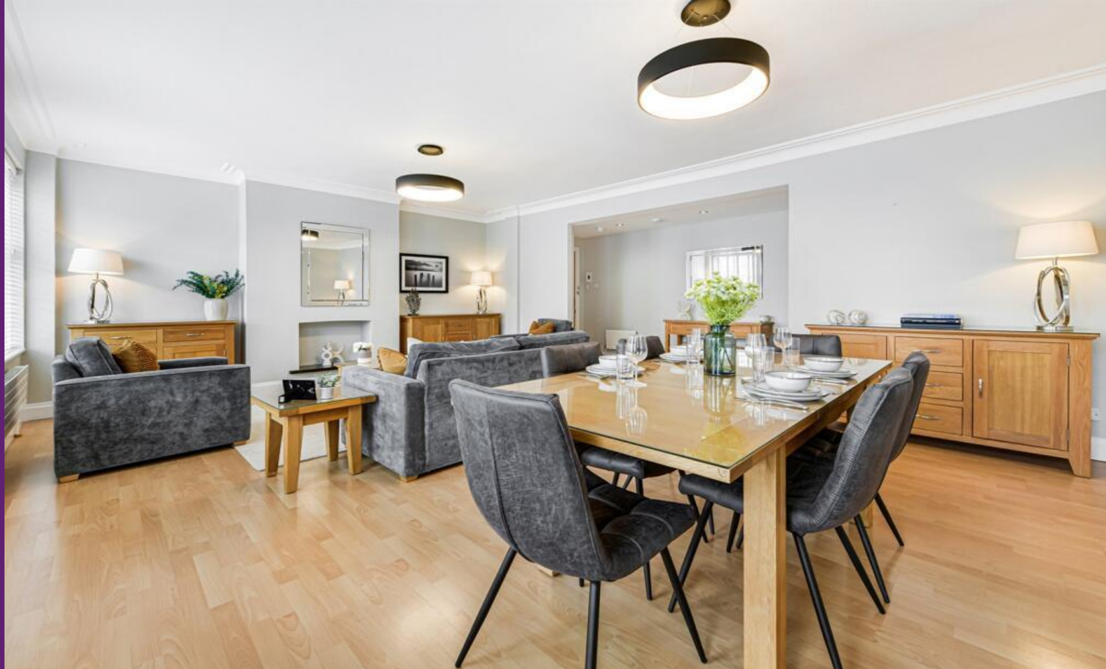
Stafford Court High Street Kensington, W8