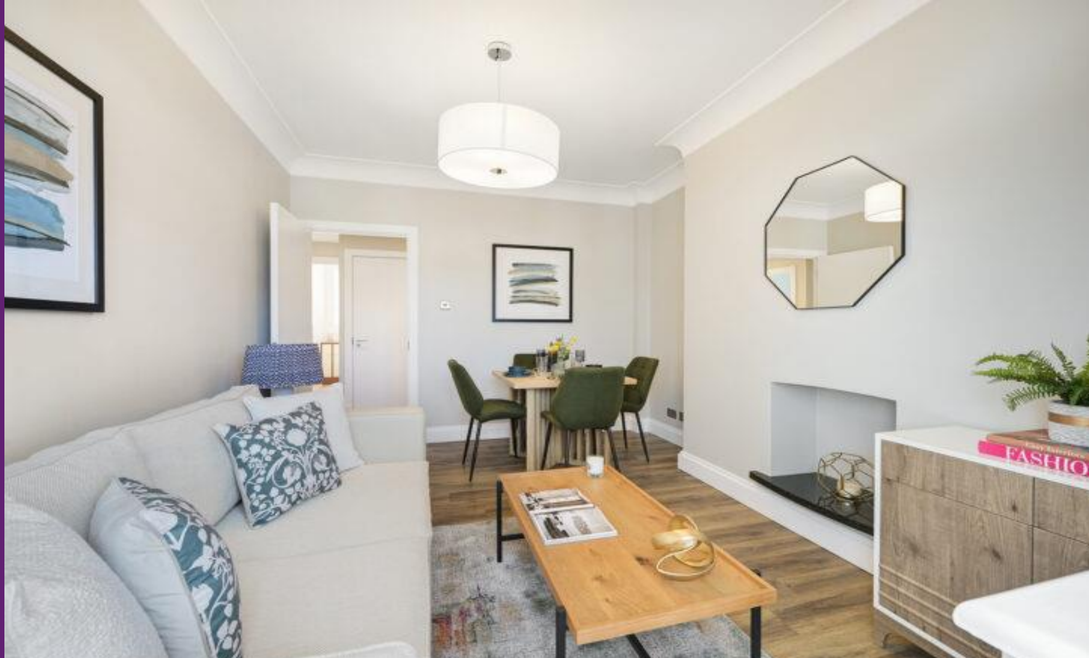
Stafford Court Kensington High Street, W8