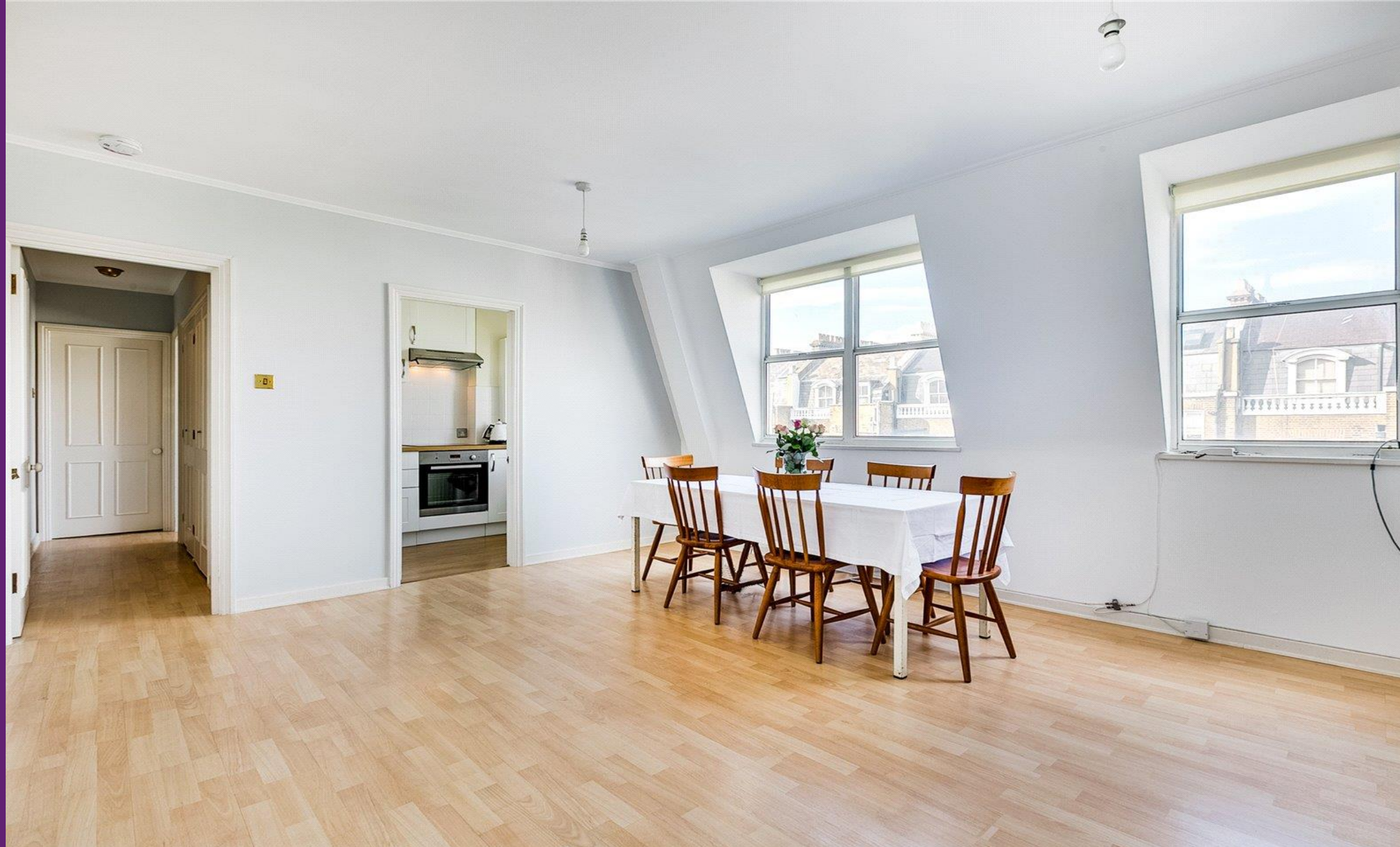
Stafford Court Kensington High Street, W8