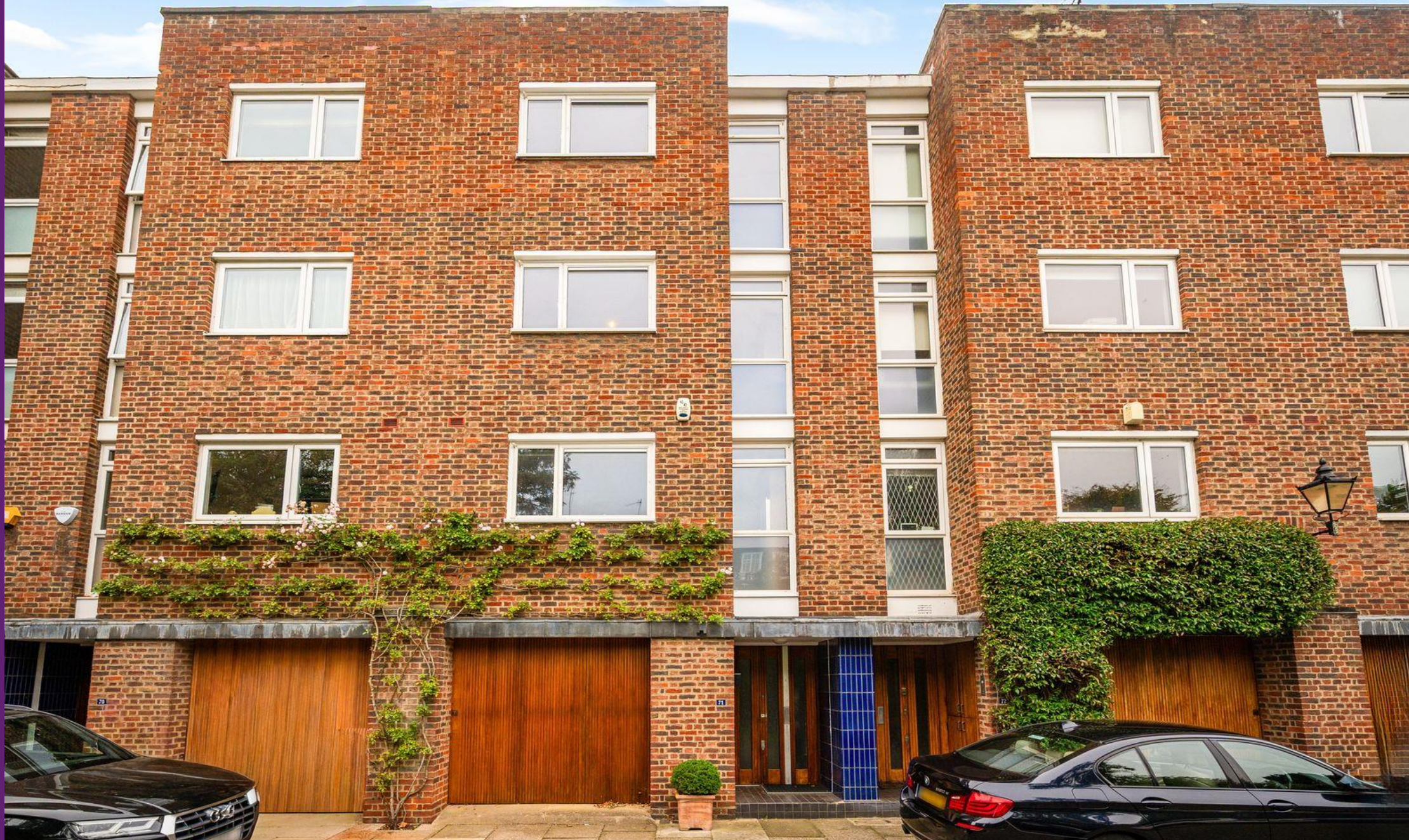
Woodsford Square London, W14