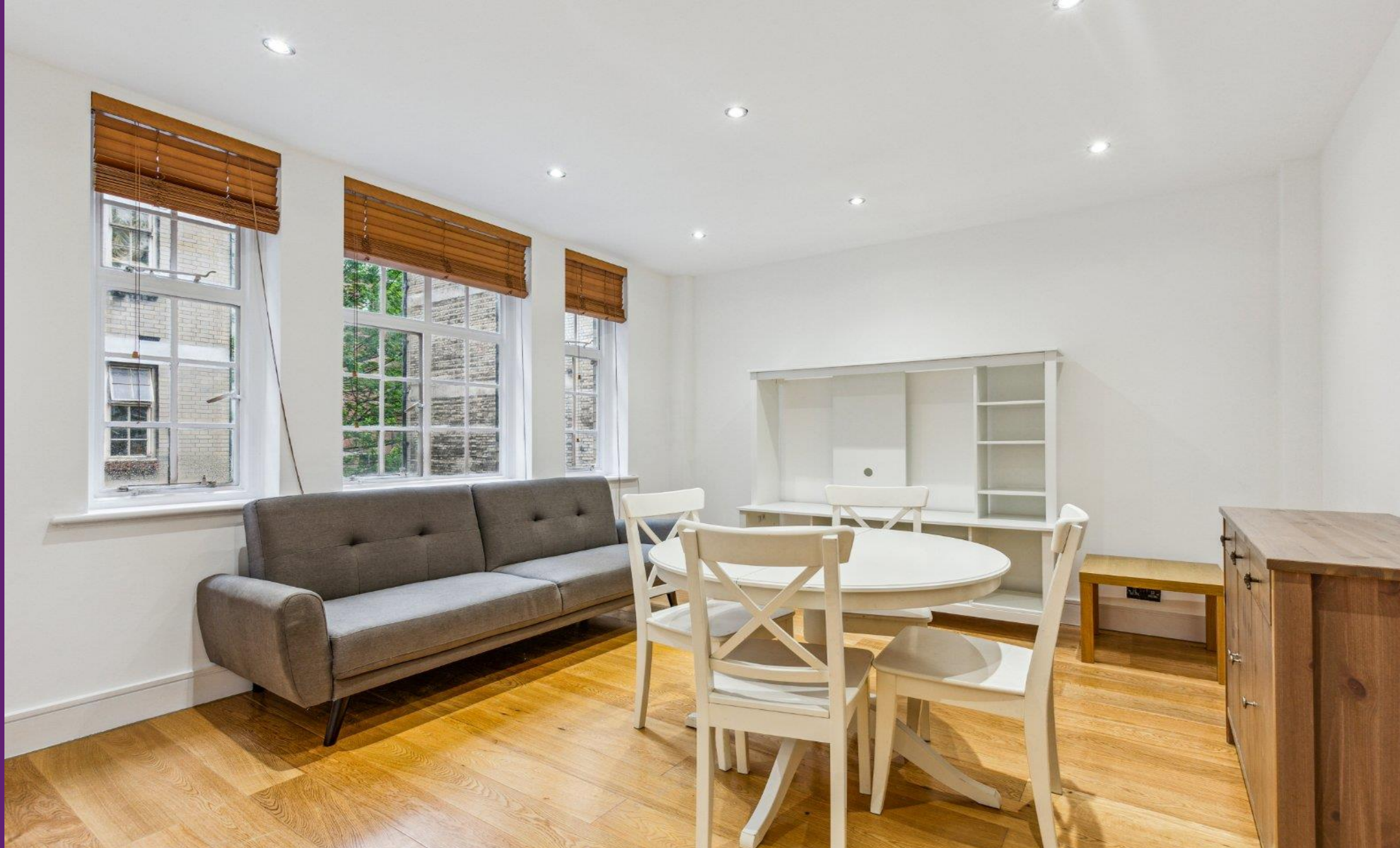
Kenton Court Kensington High Street, W14