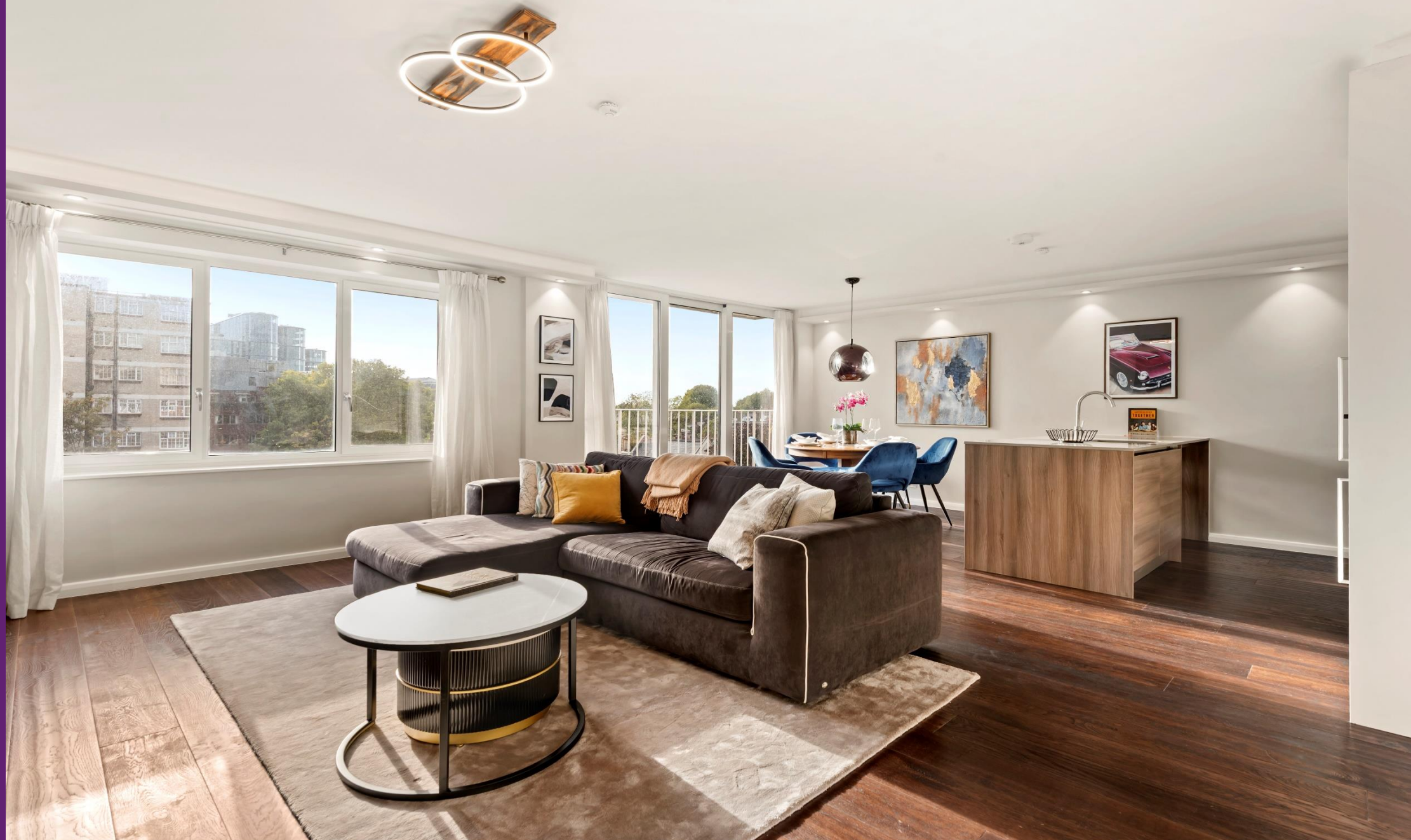
Abbots House St. Mary Abbots Terrace, W14