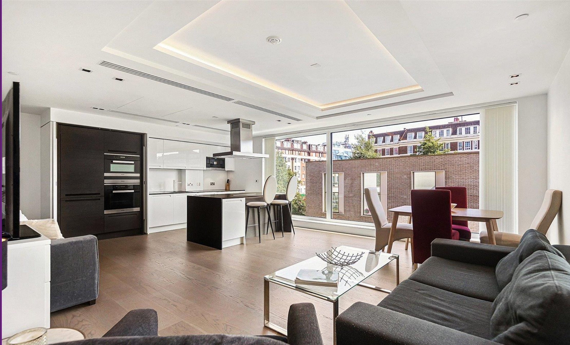
Trinity House 377 Kensington High Street, W14