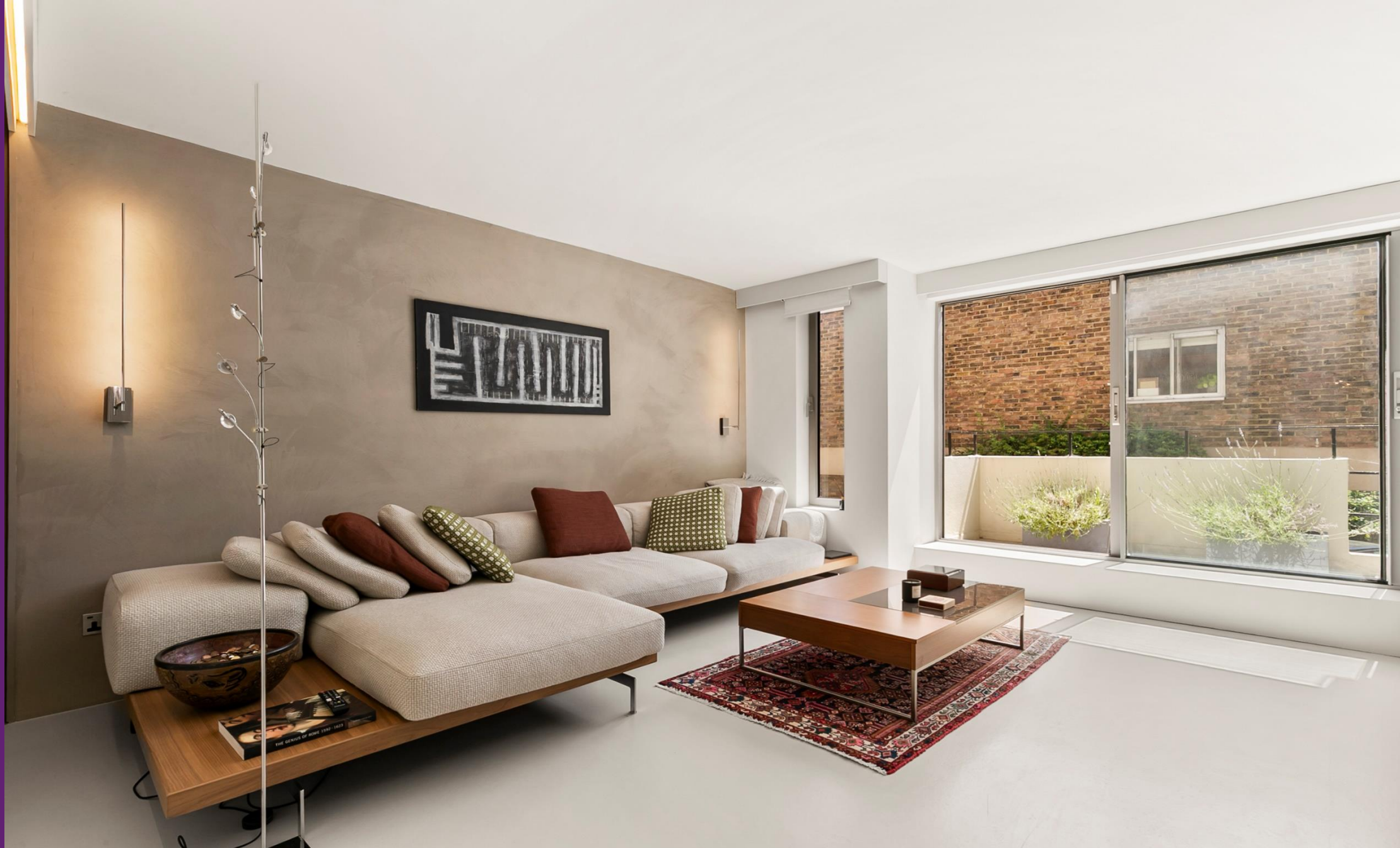
Shaftesbury Mews London, W8