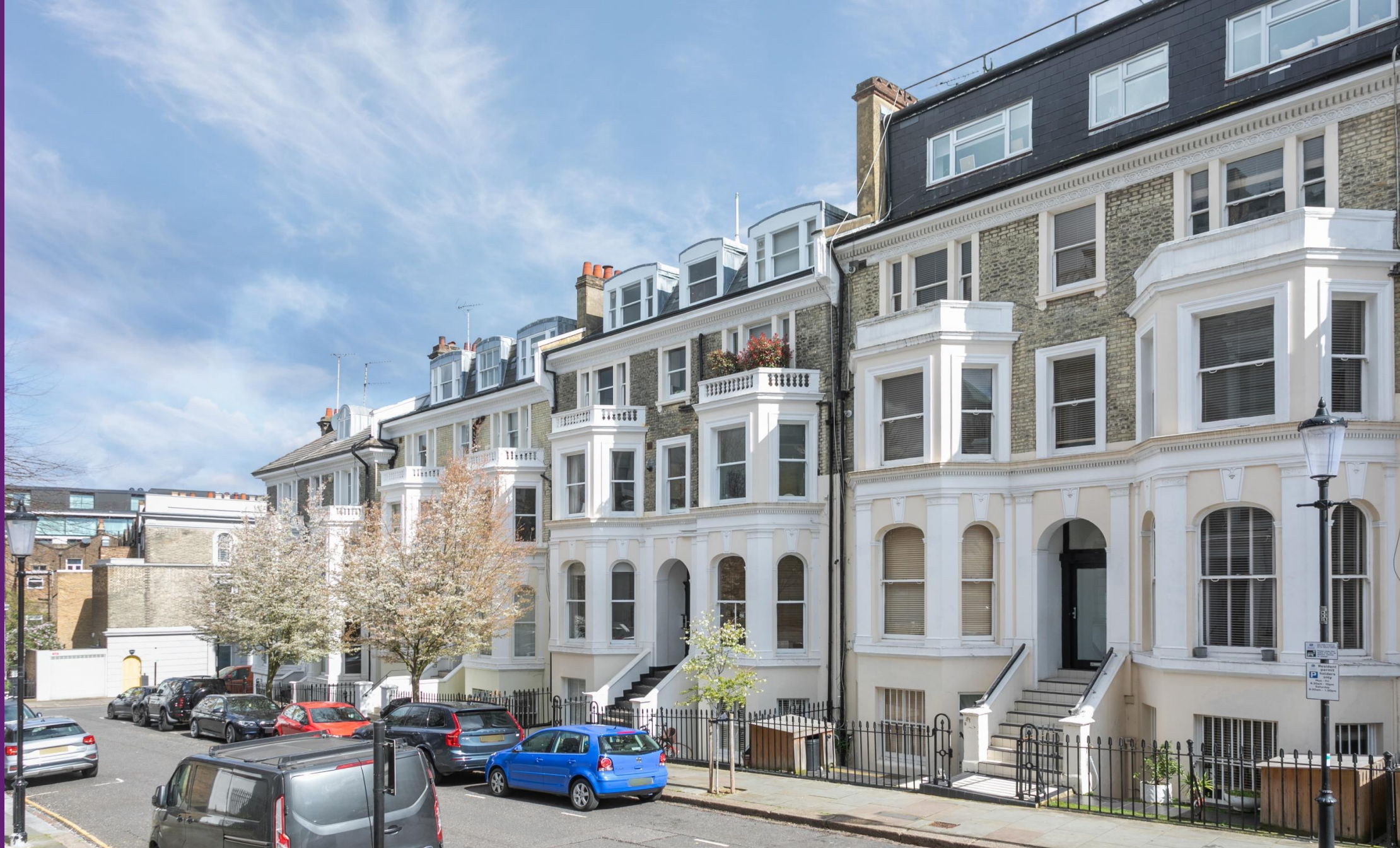
Campden Hill Gardens Kensington, W8