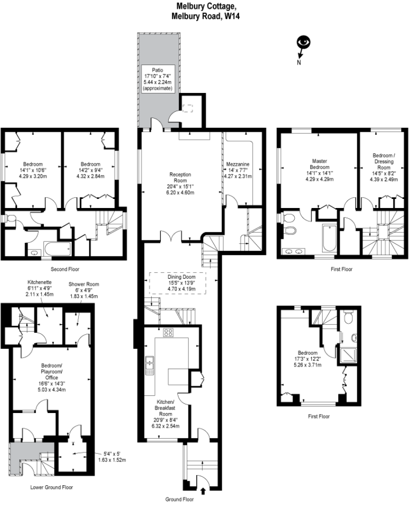
Approx Gross Internal Area 2640 Sq Ft - 245.26 Sq M For Illustration Purposes Only - Not To Scale Floor Plan Produced From Plan Supplied By Agent Ref: No. P32538