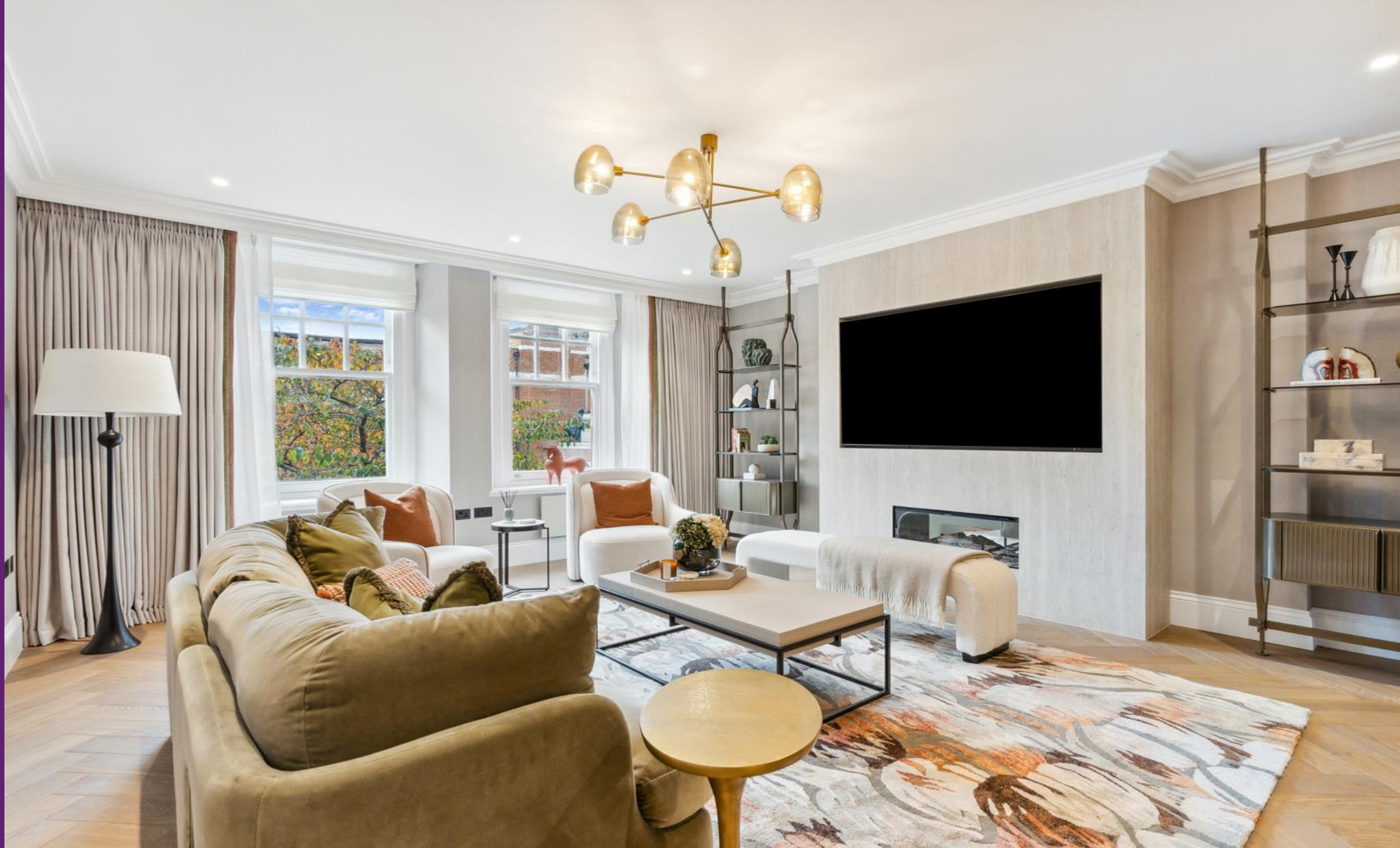
Albert Court Prince Consort Road, SW7