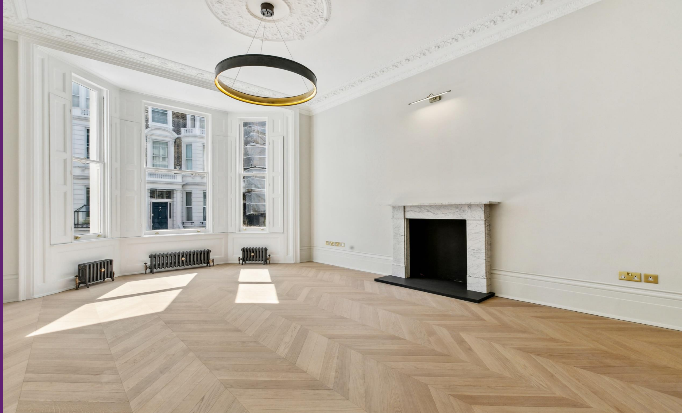
Stafford Terrace London, W8