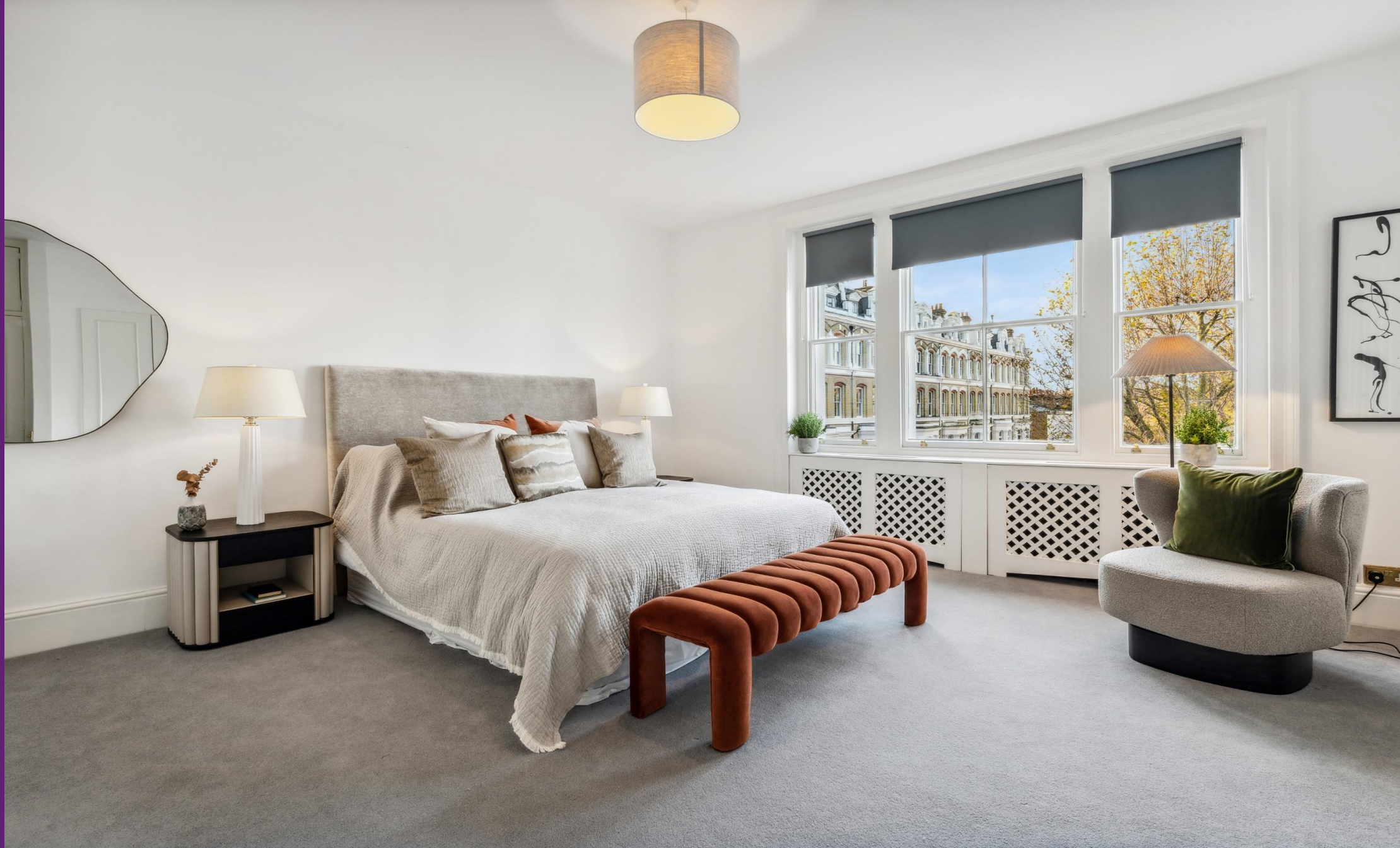
Palace Gardens Terrace Kensington, W8