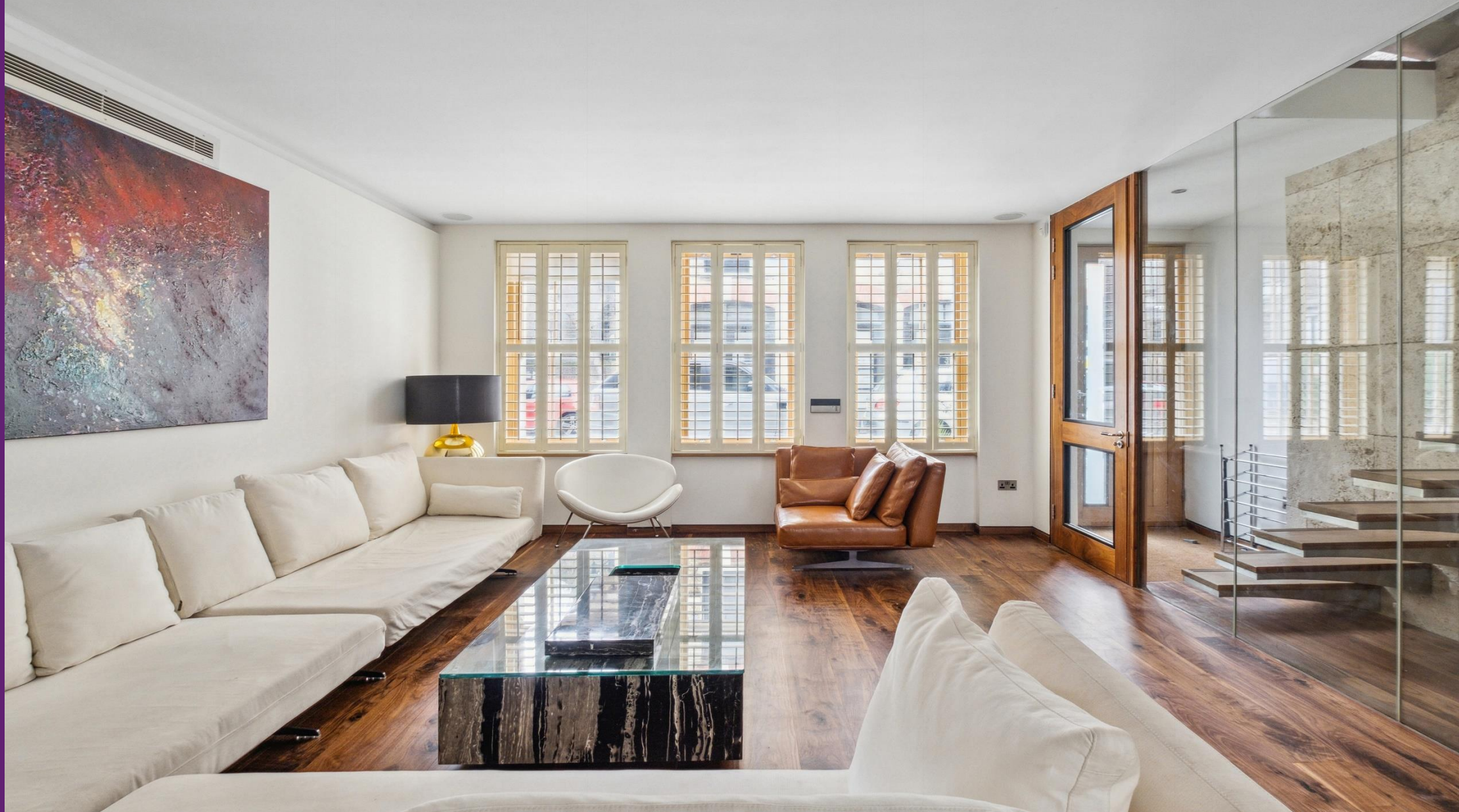
Jay Mews South Kensington, SW7