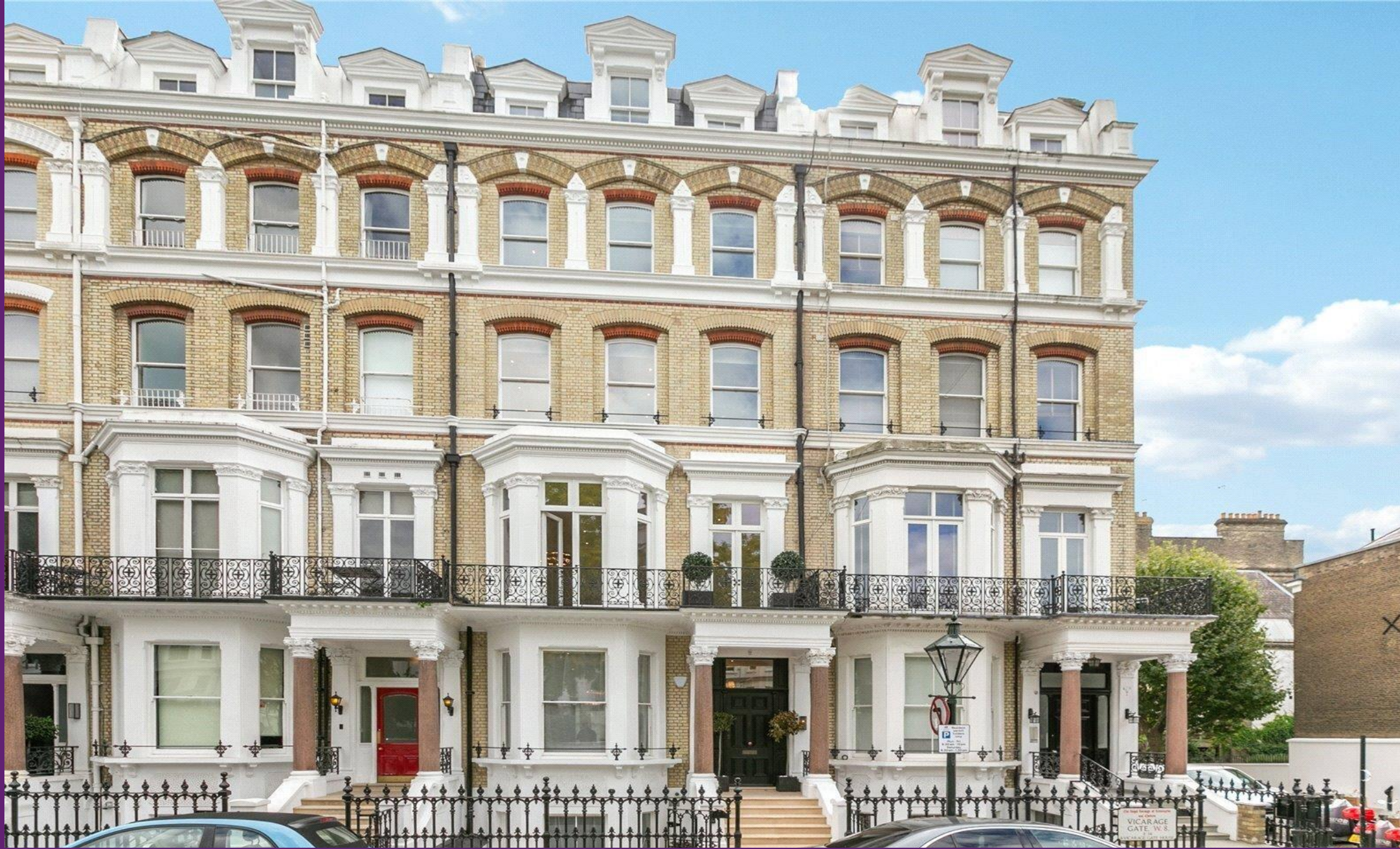
Vicarage Gate Kensington, W8