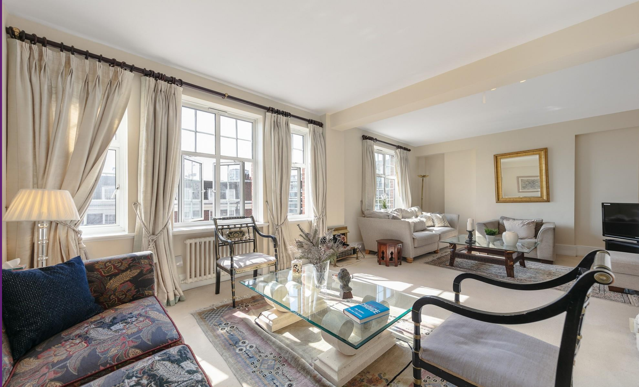
Kenton Court Kensington High Street, W14