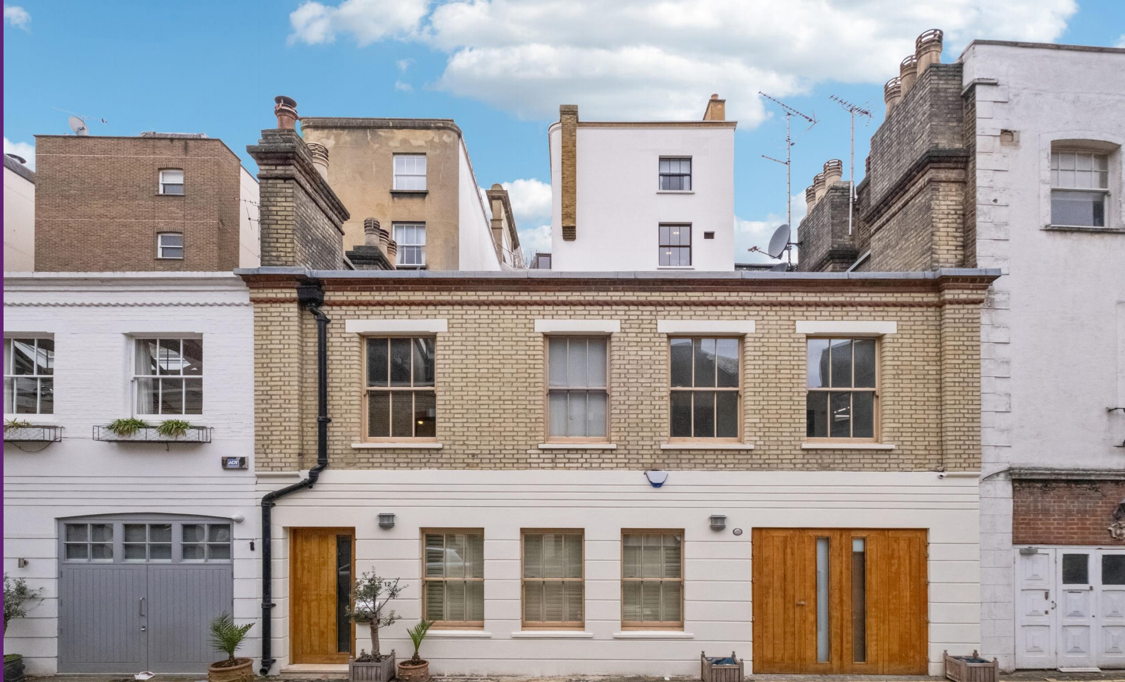
Jay Mews South Kensington, SW7