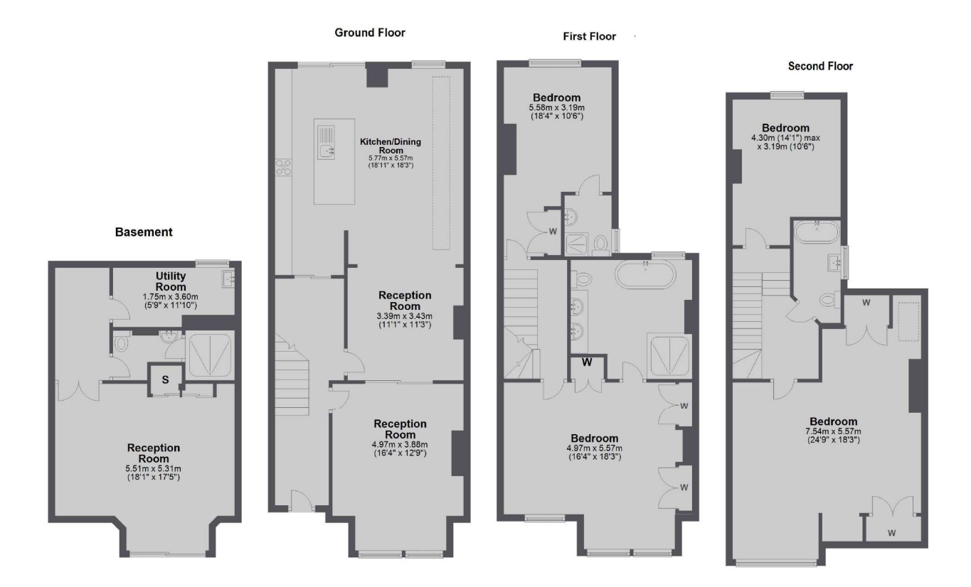
Total area: approx. 241.4 sq. metres (2598.4 sq. feet)