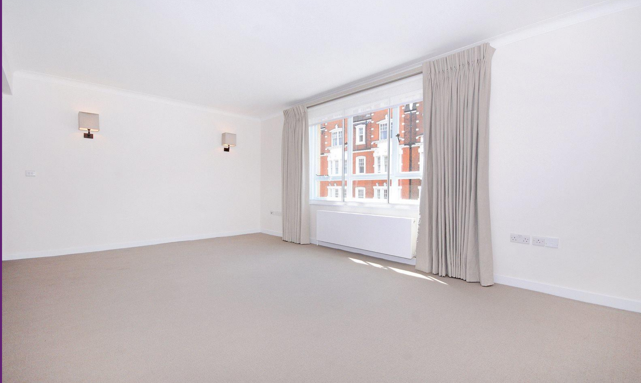
Wedderburn House Chelsea, SW1W