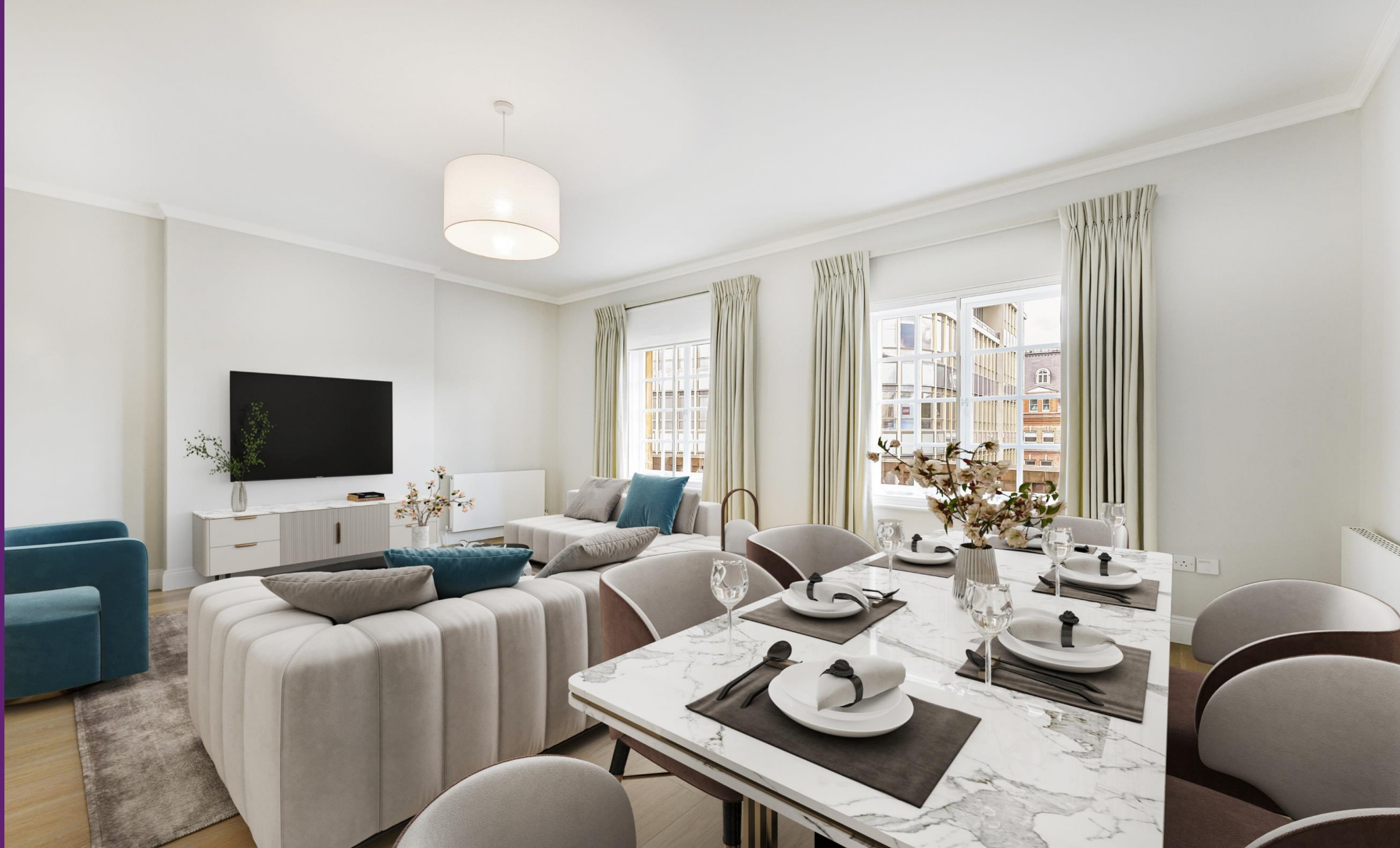
Harrogate House 29 Sloane Square, SW1W