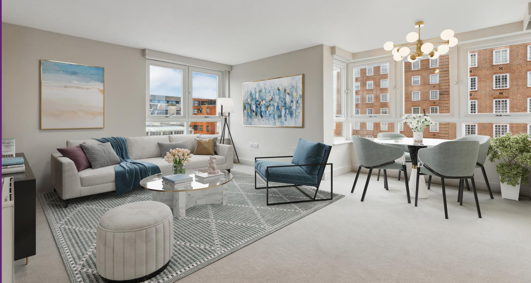
Chelsea Towers Chelsea Manor Gardens, SW3