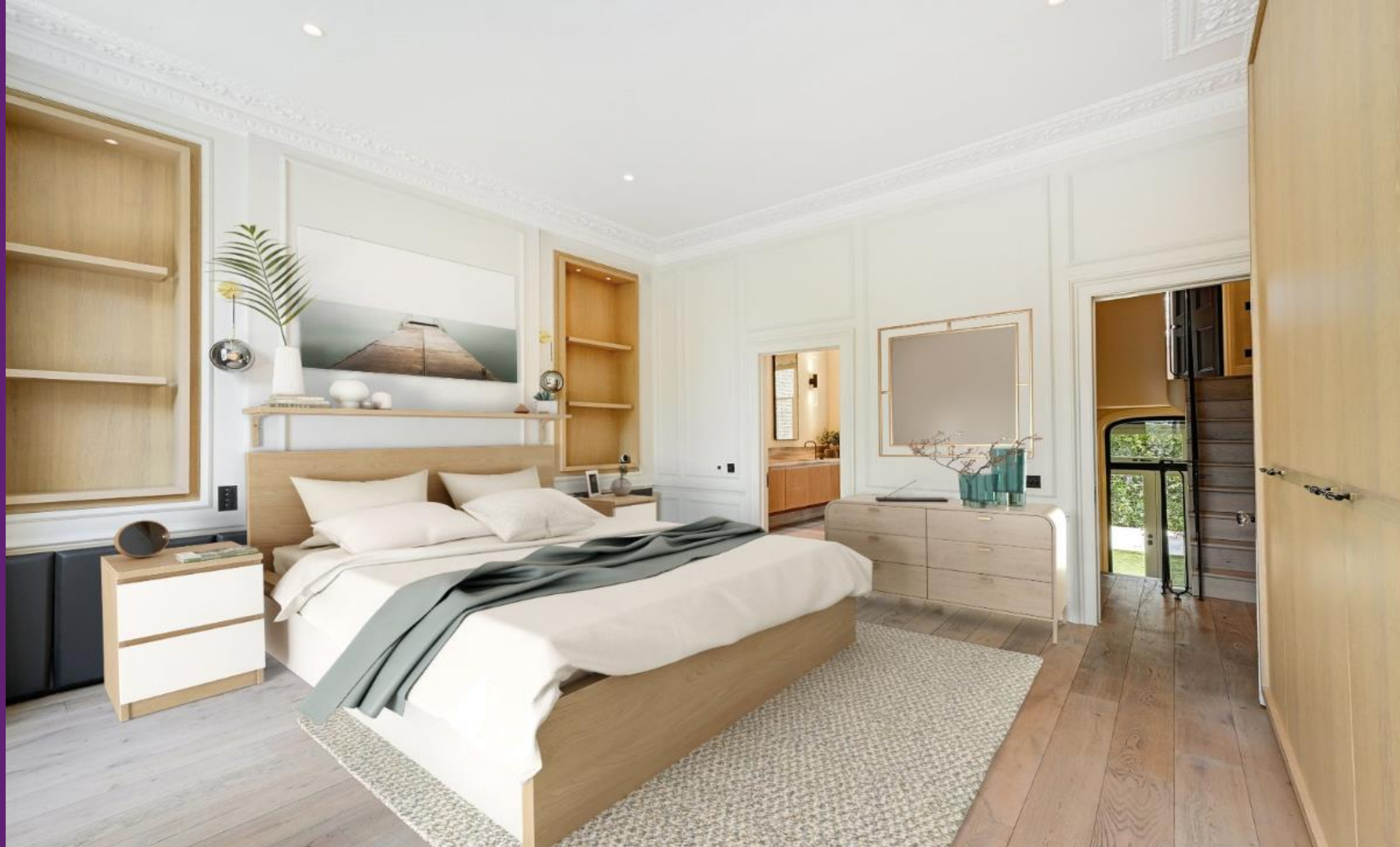
Harley Gardens Chelsea, SW10