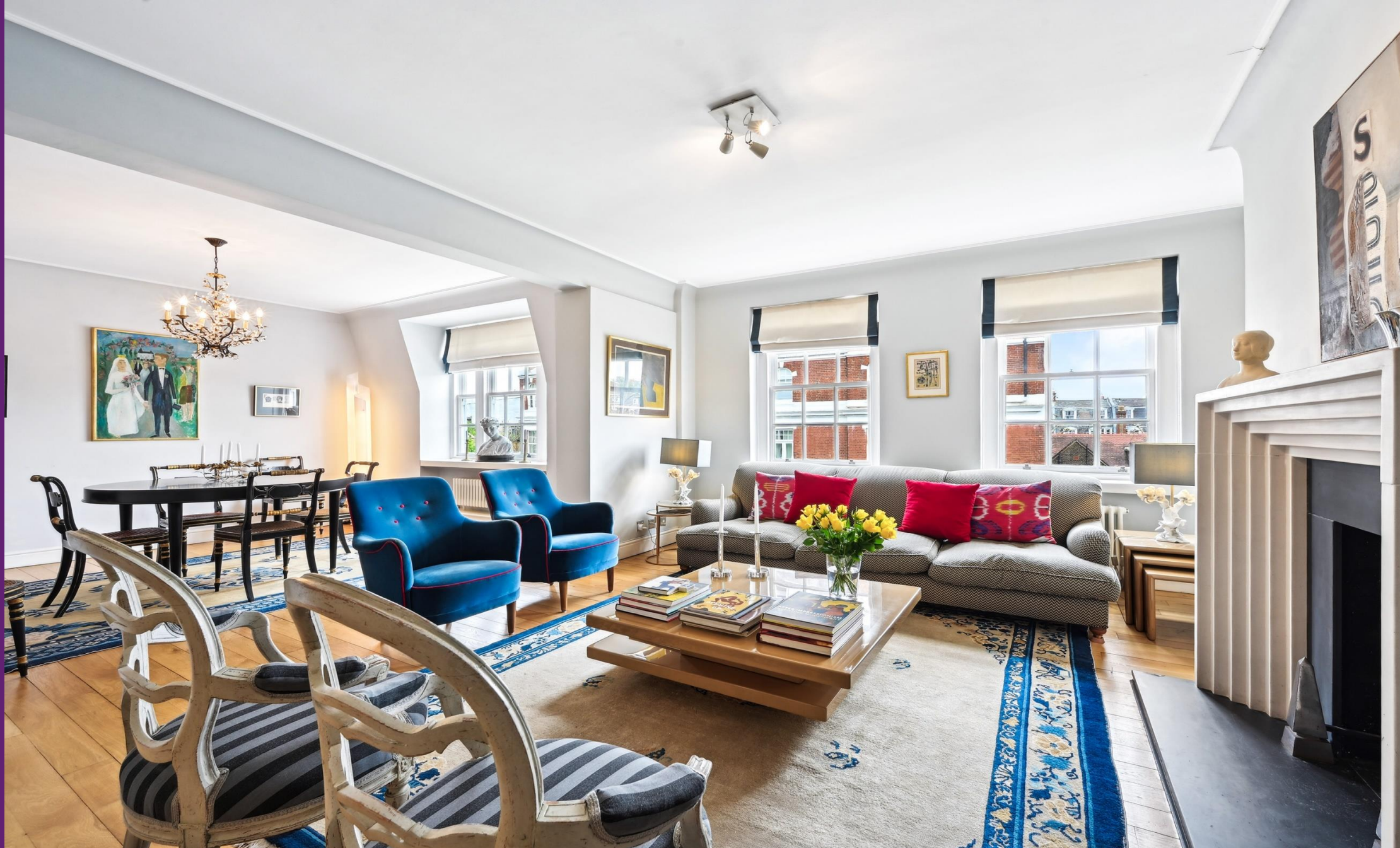
Onslow Court Drayton Gardens, SW10